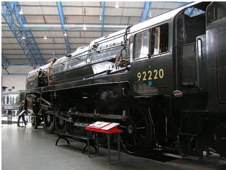
Evening Star No. 92220 - National Railway Museum, York, UK