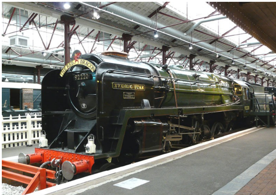
Evening Star No. 92220 - GWR Museum, Swindon, UK