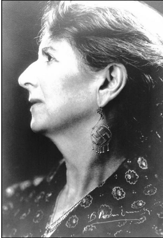
Savitri Devi (1905 - 1982)