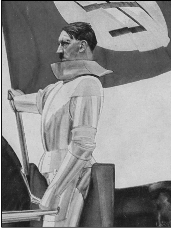
THE MAN AGAINST TIME