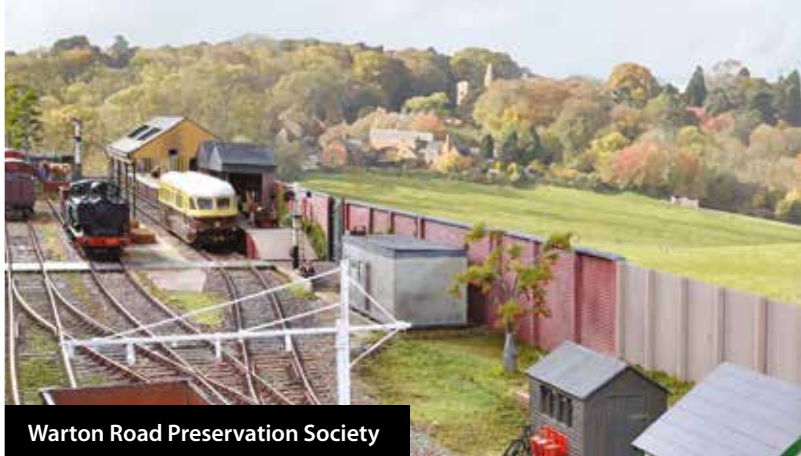
Warton Road Preservation Society