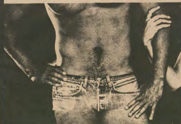
JEAN LOOK BRIEF - 2 for $7.50