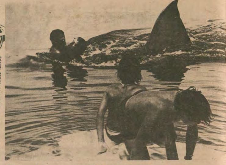
JAWS: A Million Dollar Movie Still Making Millions