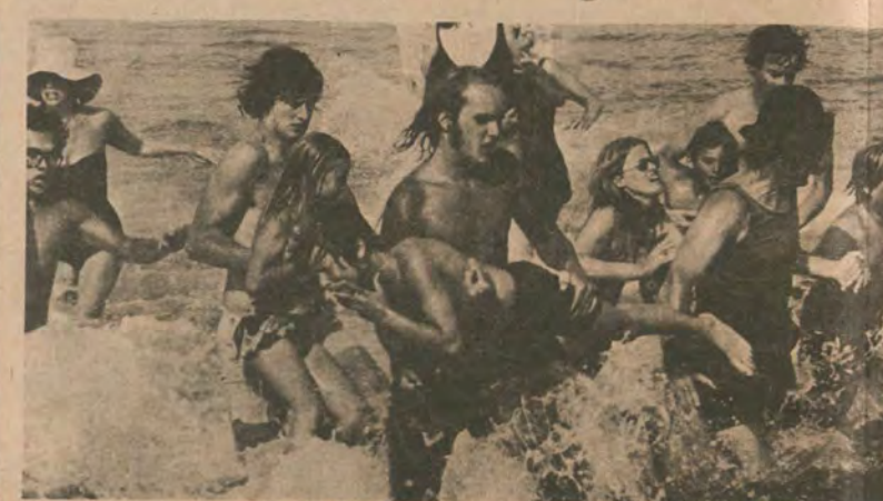
At a false warning that a shark has been sighted, bathers rush for th Amity Beach shoreline in panic