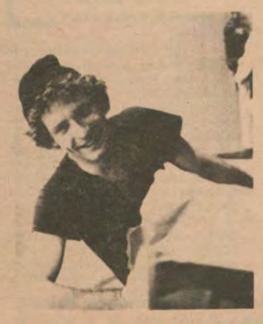
A trucker delivers a Dutch music box and initiates the action of Hand in Hand's new feature, BALLET DOWN THE HIGH WAY.

HOUSTON PRICE WAR I'm sure most of us can remember the good old days of the gasoline price wars. You know the days when regular was only 24.9¢. Unfortunately the price war that is currently being waged in Houston is not gasoline. To the glee of many, it is mixed drinks! The super bar powers in Houston have once again so benevolently decided to see which bar can hold out the longest and lowered well drink prices est and lowered well drink prices to a bare minimum. Be sure to check the bar ads in the Nuntius for the best drink buys in town!