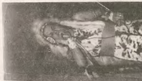
Bridget performing "Half Breed" at Mothers Place New Year.