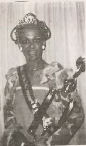
MISS GAY LOUISIANA 1974