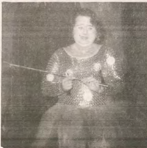
Two Ton Tillie the "Tassel Tosser" and stealer of shows - REDSTONE cast member now engaged at a downtown Houston Hotel.