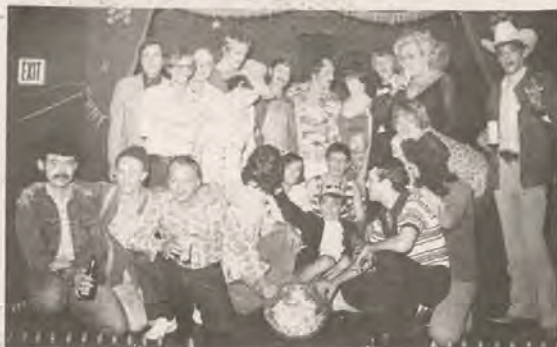
REDSTONE workers and cast shown after the benefit show with the money collected.

LARGE ARCADE featuring Movie Machines --all big screen 8mm - 25¢--