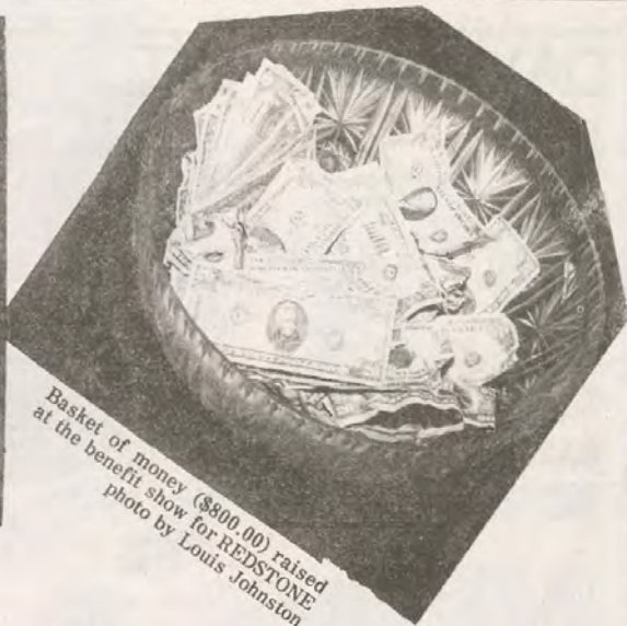
Basket of money ($800.00) raised at the benefit show for REDSTONE