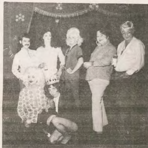
Cast of REDSTONE REVIEW