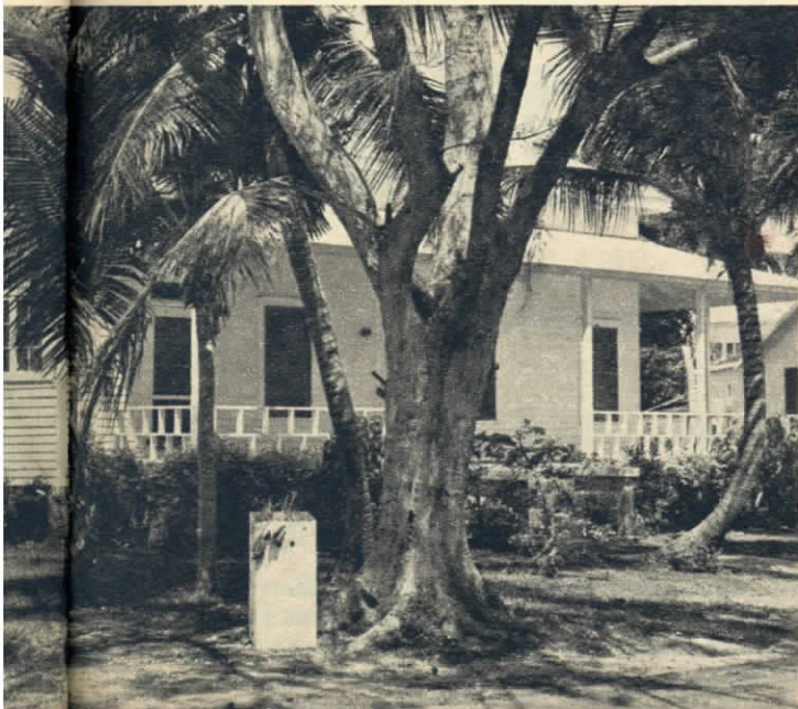
EVERY ROOM, LISTENING IN FROM HOUSE (RIGHT).