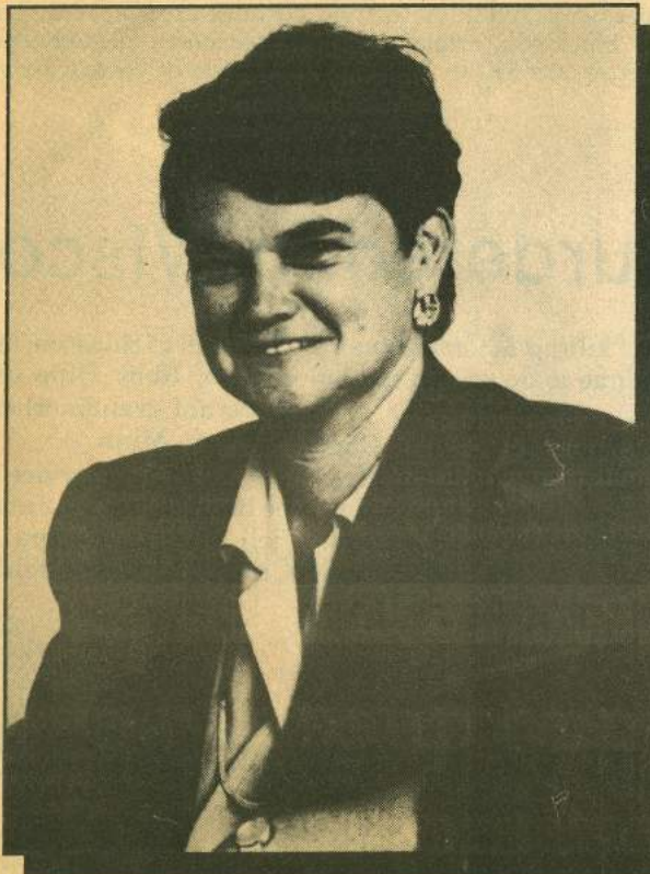
Sheila James Kuehl

Sponsored by Montrose Activity Center and Metropolitan Community Church of The Resurrection with Featured Speaker