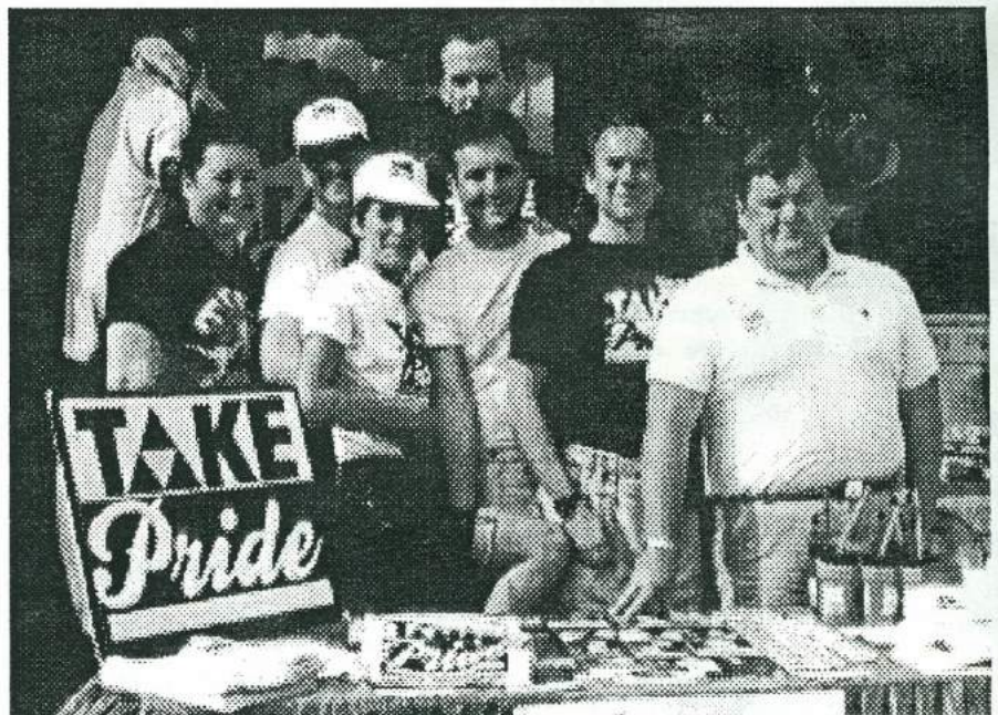
Pride Week volunteers were out in force at the recent Westheimer Arts Festival.

Please make an effort to join us at the Pride-A-Thon on May 31st at Rich's. λ