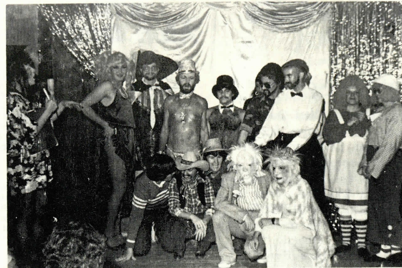
Halloween party at the Fortress Club.