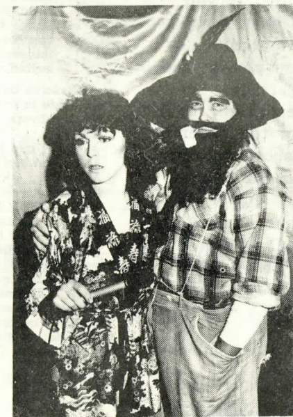
Halloween winner at the Fortress Club.