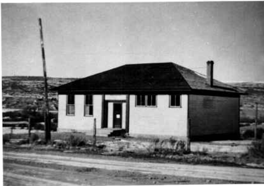
Fig. 8.-The seventh Burntfork School

improved materials and books were brought in. Education was carried on to the eighth grade. By 1927, there was a public school bus or team for the transportation of pupils, who heretofore, rode horseback or walked to school. 44