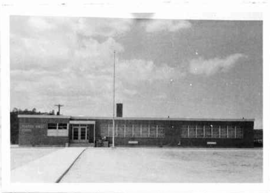
Fig. 19.-The Flaming Gorge School

ported to Manila. The curriculum consists of the basic course of study for grades one through six currently in use in the state of Utah. Progress reports continue with the letter system of grading, however, study has been undertaken toward the adoption of a different type of report card, similar to that used by other Utah districts.