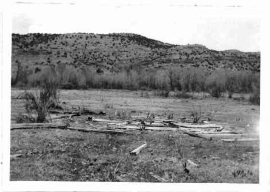
Fig. 23.-The site of the west Linwood school.

northwest of Linwood. (Fig. 23.) The building was later moved and is now used as a shed by one of the ranchers.