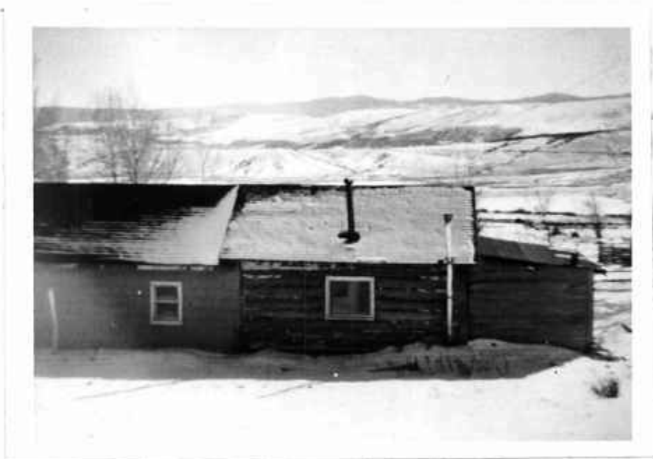
Fig. 27.-The Antelope School