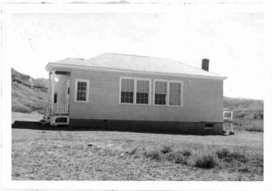
Fig. 18.-The Clay Basin School

clining rapidly during the last few years of its existence.