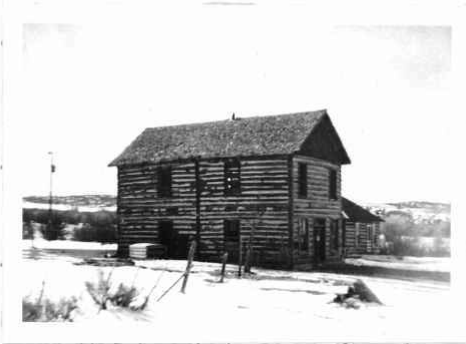
Fig. 5.-The fourth Burntfork School

hickory stick, always keeping a switch right over the door where it would be most handy for immediate use.