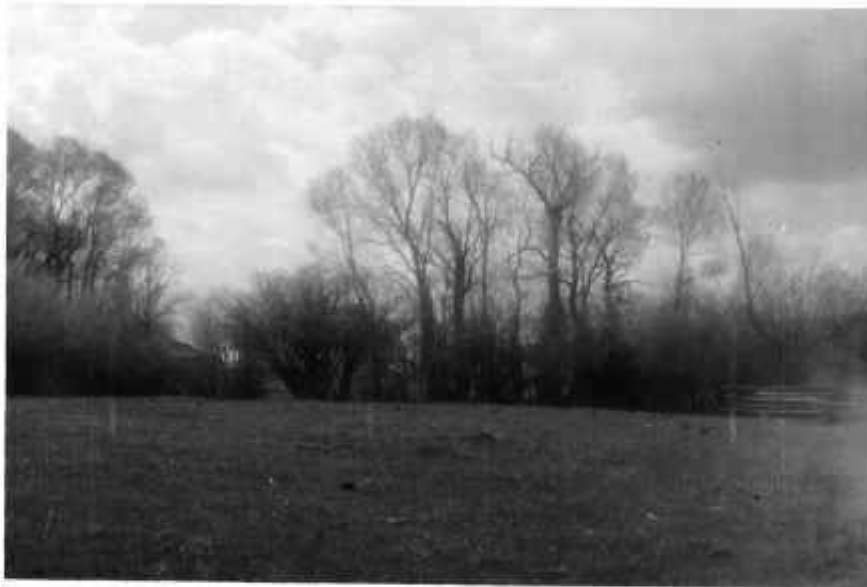
Fig. 6.-The site of the fifth Burntfork School.

These funds were supplemented by appropriations from the Common School Land Income Fund.