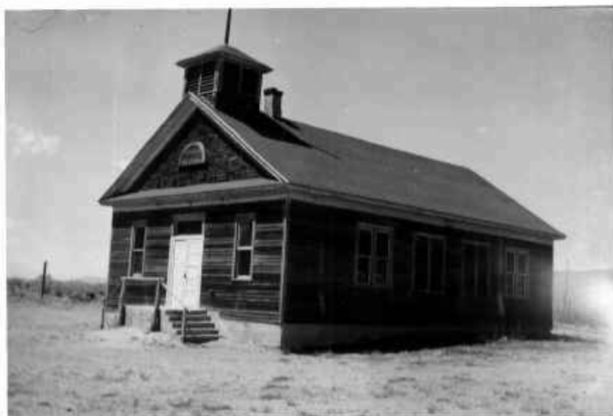
Fig. 13.-The Ladore School

wide and fifty feet long, with a good wooden floor resting upon a cement foundation, it still stands at the original location. (Fig. 13.)