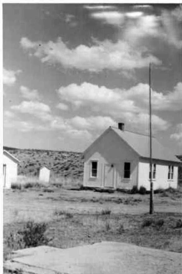
Fig. 14.-The second Beaver Creek School.