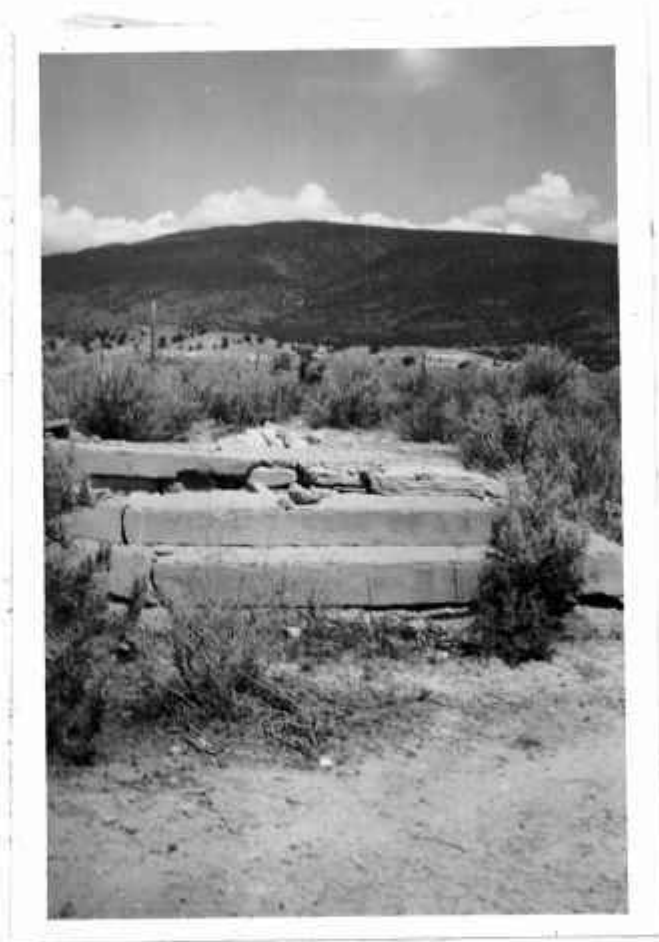
Fig. 12.-The Site of the First and Second Beaver Creek Schools

forty-four miles southeast of Manila, some three quarters of a mile east of the Utah-Colorado boundary, and just north of the present road. 2 (Fig. 12.)