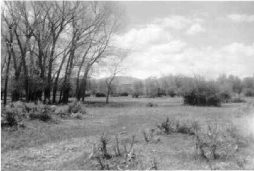
Fig. 21.-The site of the first school

wood stove. The building was later used as a homestead by Jim Large and was ultimately torn down. 10