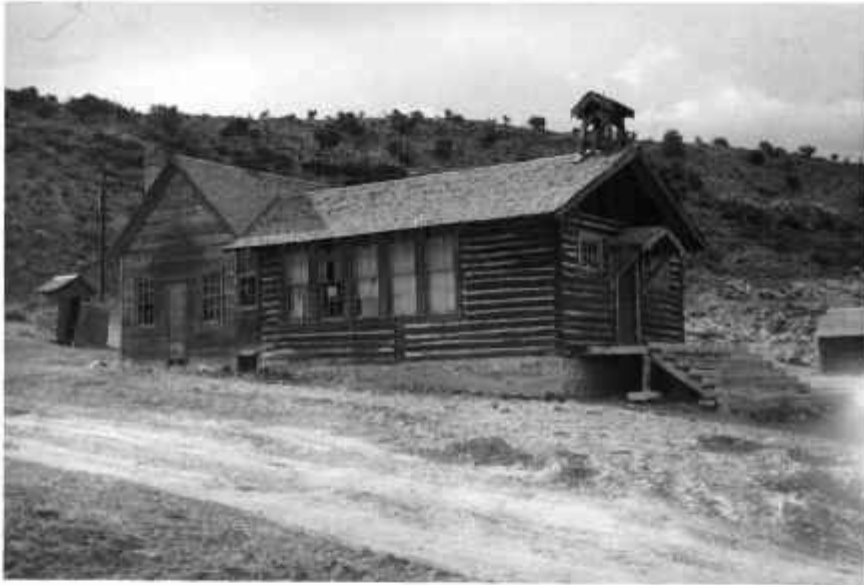
Fig. 26.-The second Washam School

determine whether or not they graduated. In 1935, there was a small library, connected with the public library in Green River, having nearly three hundred volumes available for use by the pupils. Other equipment, such as wall maps, charts, and globes, was provided. 50