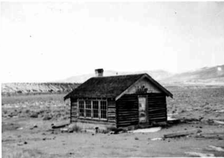
Fig. 16.-The second Bridgeport School

in dimensions, of log construction, with a shingle roof, lumber floor, and walls lined with celotex. 18 This school operated from 1938 until 1943, when it closed due to the inability of the Board to obtain teachers for the remote area. It was sold to Jesse Taylor for $100.00 in 1952. 19 (Fig. 16.)