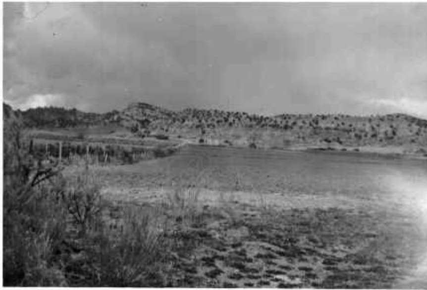
Fig. 25.-The site of the first Washam School

Milnes' Standard and Elementary Arithmetic Jones' and Blodgett's Readers Mother Tongue Grammar Tarr's and Murray's Geography Blaisdell's Physiology Gordy's and Barnes' Elementary History Palmer's Writing Methods 43