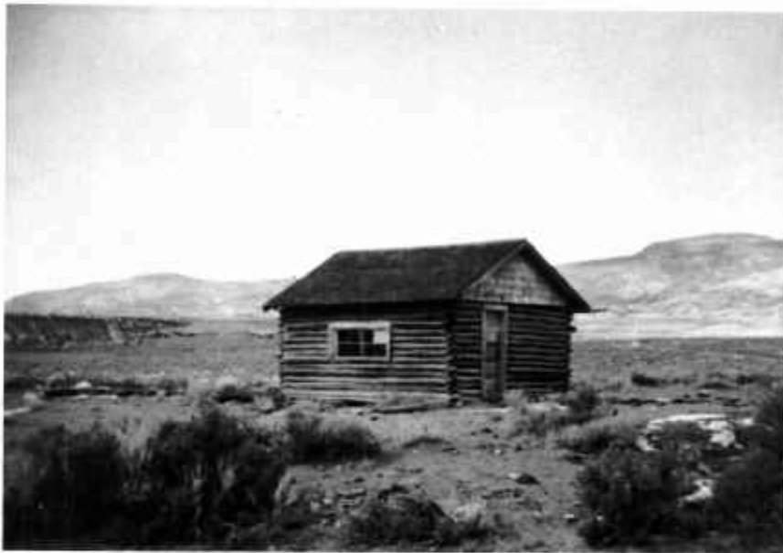
Fig. 15.-The first Bridgeport School

twelve by fifteen feet in size, later serving as a teacherage when a new school was built nearby. The building still stands at Bridgeport. (Fig. 15.)