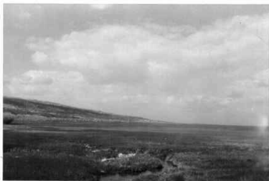
Fig. 4.-The site of the third Burntfork School

Grading began in this school in the Burntfork area. The curriculum consisted of reading, writing, arithmetic, spellings, language, geography, and history. There was great dependence upon recitation of the formal type. In the forenoon, pupils studied arithmetic, reading, and history, and in the afternoon, spelling, geography, and language.