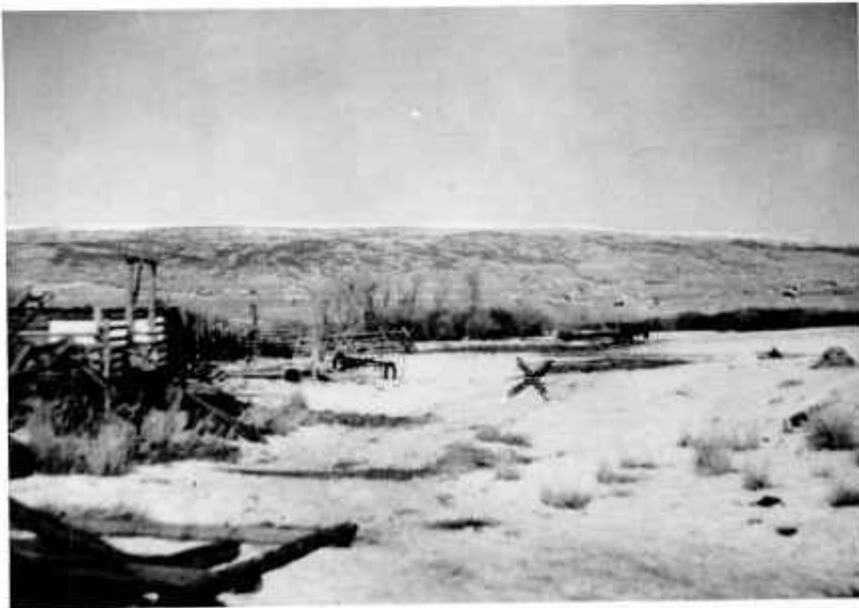
Fig. 2.-The site of the first Burntfork School

with a dirt roof, and was heated by a large wood stove. Drinking water was secured from the spring at Burntfork. 6