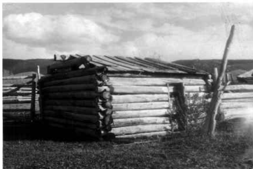
Fig. 9.-The school at the Gamble ranch