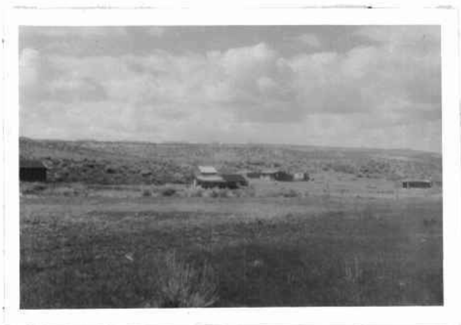
Fig. 10.-Coon Hollow

Because of a lack of written records, it was rather difficult to obtain information about the Coon Hollow School, particularly in regard to teachers. Following is a list of teachers who taught at Coon Hollow: