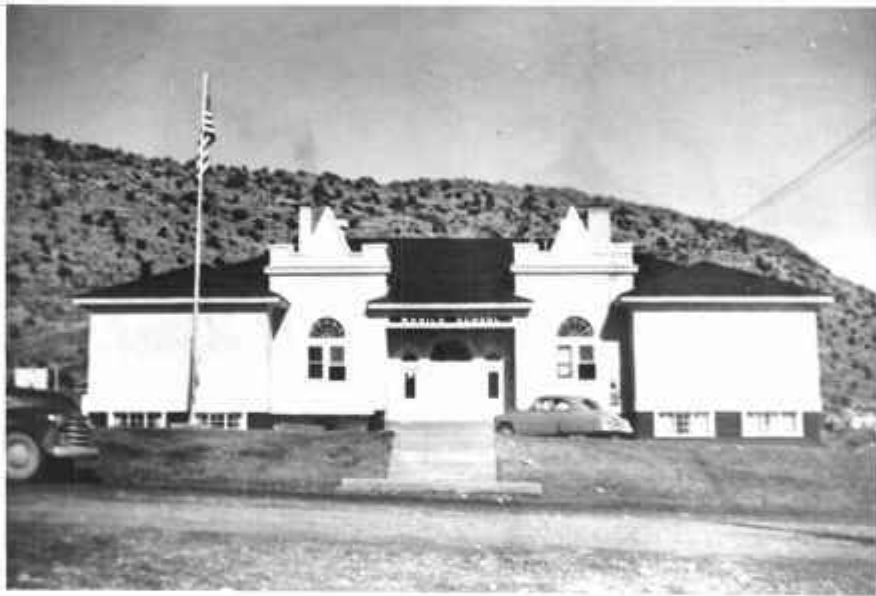
Fig. 32.-The fourth Manila School

providing two classrooms, a shop, kitchen, two indoor lavatories, and a room to house an electrical generating unit. Entrances on the east and west sides were also completed. 36