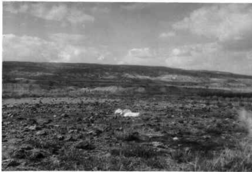
Fig. 3.-The site of the second Burntfork School

Enrollment in this school was as the following list indicates: