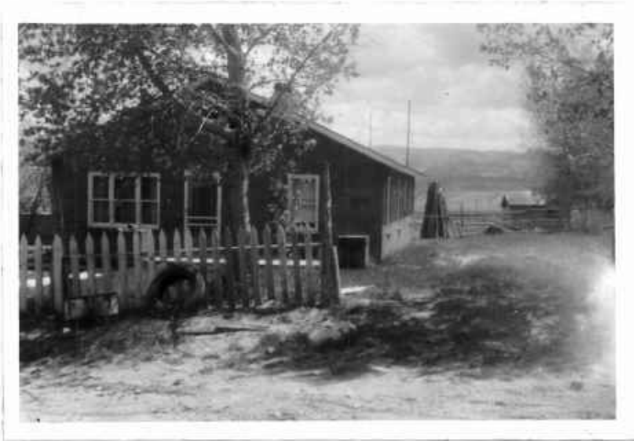
Fig. 29.-The site of the first Manila School