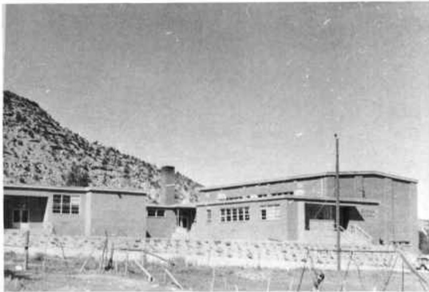
Fig. 34.-The east wing of the Manila School

On the main floor, to the southwest, the first and second grade room was situated; to the northwest, the third and fourth grade, and directly across the hall from the latter, the typing classroom. The old auditorium was divided into a fifth and sixth grade room and a high school room. The south entrance was left extant, and directly east of that, in the former office, a new library was constructed. In the southeast corner, another high school room was placed.