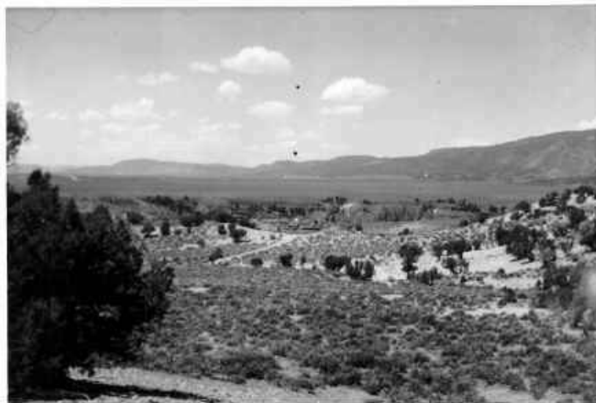
Fig. 17.-The Crouse Ranch