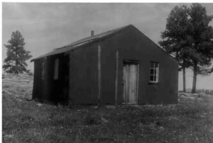
Fig. 28.-The third Greendale School

A school was reopened in the fall of 1952 and continued for three years, utilizing the bunkhouse on the Burton ranch. This was a small, tarpaper-covered building, which was attended by eight students. (Fig. 28.)