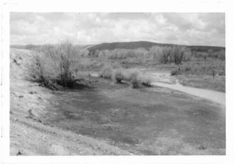
Fig. 22.-The site of the school at the Stouffer ranch.

sheep interests. 14 School was carried on from four to six months of the year, with a curriculum of reading, writing, arithmetic, geography, history, spelling and drawing. There was no grading.