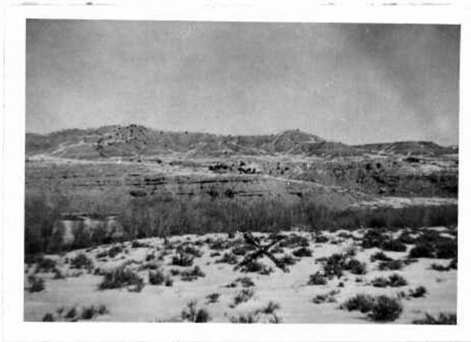
Fig. 20.-The site of the school on the Dick Son ranch

County funds were apportioned for the support of the school as outlined: