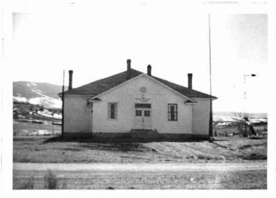
Fig. 11.- The McKinnon School

From the time instruction began, the school has maintained an academic year of from eight to nine months, continuing the graded one through eight system, until 1927, when the first two years of high school were added, and carried on according to the availability of teachers and funds. 63