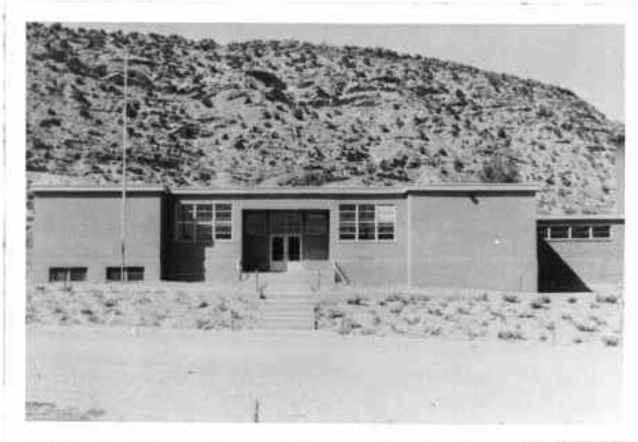
Fig. 33.-The west wing of the Manila School

on the walls and ceiling was completely removed, leaving only the wooden framework and studding. Sheetrock was placed upon the walls and accoustical tile added to the ceilings. Linoleum flooring was installed, along with a completely new electrical and heating system.