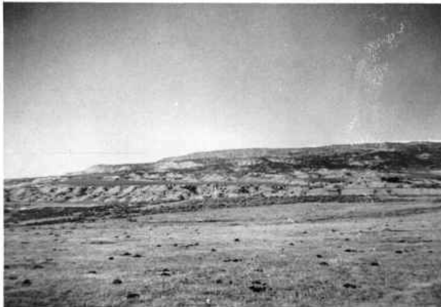
Fig. 7.-The site of the sixth Burntfork School

This school building was located about one-quarter of a mile east of the present Burntfork School, on the north side of the Burntfork road. (Fig. 7.) It was a log structure, later covered with wood lining, and had a plank floor and a shingle roof. It consisted of one room, thirty-five feet wide and forty-five feet long, heated by a box heater in the center of the room. It operated continuously until May of 1924, when it burned down after being ignited by smoldering trash. 32