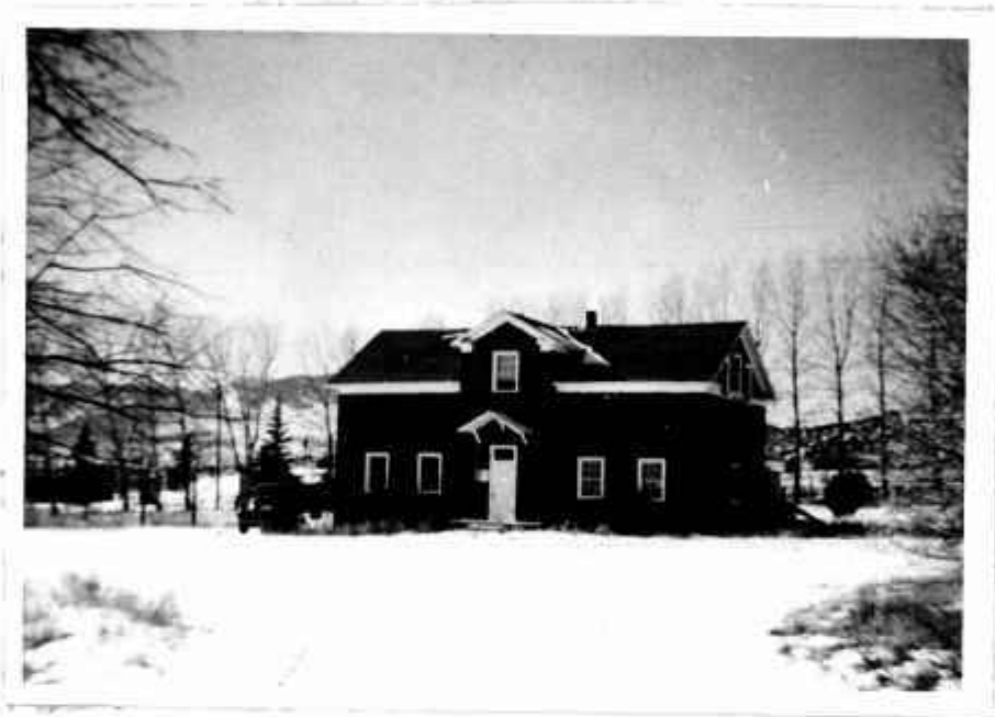
Fig. 31.-The third Manila School

A curriculum of reading, writing, arithmetic, spelling, geography, language, and history was provided, and by 1915, the first two grades of high school were added. In 1913, printed report cards were in use. The school was divided into the following classrooms: on the ground floor, the north room, grades one, two, and three; south room, four, five, and six. On the second floor were located grades seven and eight, plus the first two years of high school. Geometry, literature, English, and history were taught in the upper grades. The