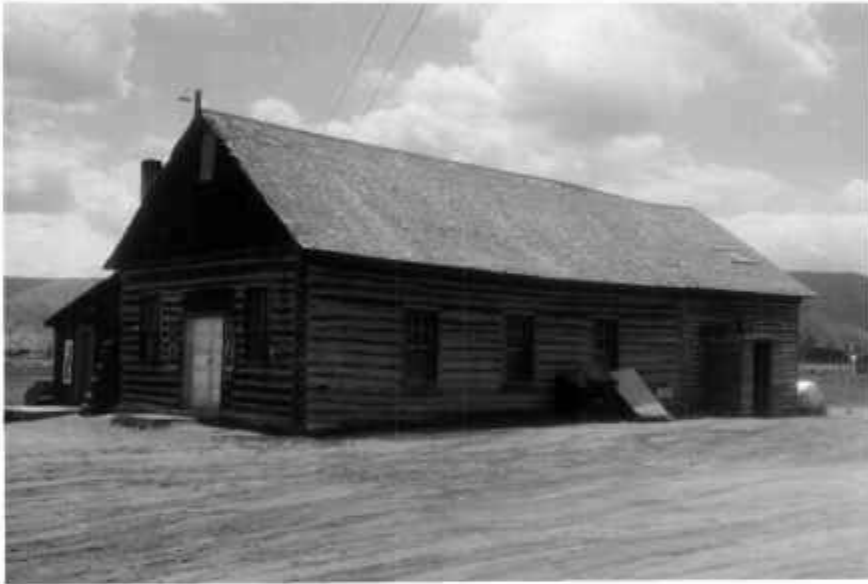
Fig. 30.-The second Manila School

heater, and drinking water was secured from the community tank, one block northwest. It was equipped with blackboards, fairly good furniture, and a number of wall maps.