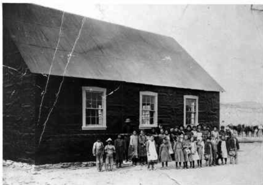
Fig. 24.-The Linwood School

County District Number Seventeen in the fall of 1904. 25 Materials and labor were donated by citizens of both districts and the school was located on the Utah-Wyoming state line, about three and one-half miles due east of Manila and one-half mile west of Linwood. (Fig. 24.) The ridgepole of the building was laid directly on the line so that the southern half of the school was in Utah and the northern half in Wyoming.