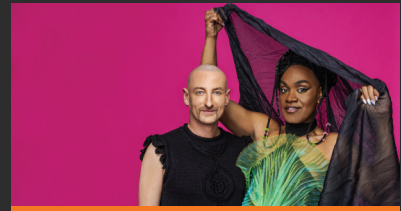
Eurovision Song Contest 2024 2.4 million Total TV national reach