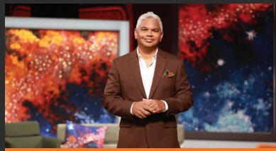
The Point 1.1 million Total TV national reach