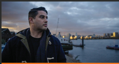
The Mission 1.1 million Total TV national reach