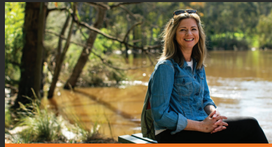
Great Australian Walks with Julia Zemiro 2.7 million Total TV national reach