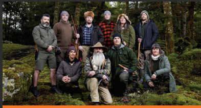
Alone Australia Season 2 4.5 million Total TV national reach