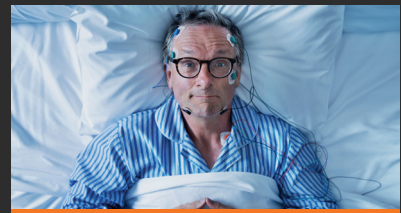
Australia's Sleep Revolution with Dr Michael Mosley 1.1 million Total TV national reach