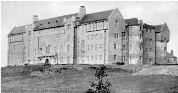
Queen Victoria School, exterior

QVS had a military culture – a culture that had ‘always been one of physical activity’. 293 It was a culture in which the expectation of staff and pupils alike was that disputes would be resolved by fights at the ‘magic circle’. It was a culture that paved the way for physical abuse to flourish. Many applicants experienced it. There was brutal physical abuse of younger children; they were subjected to some dreadful ordeals. Some of them appear to have echoed the treatment of junior servicemen and recruits which the armed forces are reported as having been trying to address since the 1990s.