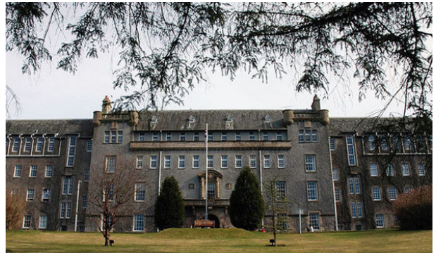
Queen Victoria School, front entrance

The school was also to be a memorial to the Scottish soldiers and sailors who had died in the Boer Wars in South Africa and to provide support, education, and a stable and secure boarding school environment for boys who had been left fatherless. 20 The QVS Constitution included an undertaking by His Majesty's Principal Secretary of State for War that the 'School and Chapel shall be maintained in perpetuity'. 21