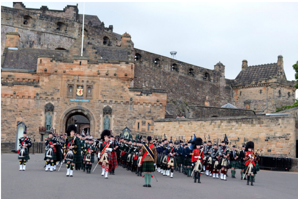
Queen Victoria School pipe bands at the Royal Edinburgh Military Tattoo

played in the Edinburgh Tattoo with the pipe band and I went to Canada to play in a Tattoo there ... That sort of thing stays with you your whole life. It was brilliant going to Canada and something I'm really proud of. I still talk about it. Not many people get an opportunity to have that sort of experiences in their childhood. 232