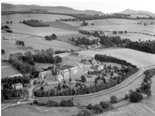
Aerial view of the school, 1947

Some found it intimidating. ‘Hamish’ said: ‘It was a very grey day and the school looked very much like a prison to me.’ 53 ‘Andy’ described the main building as ‘like Colditz ... I always remember my first impression coming round the corner from the bus stop and suddenly seeing this great monolith, as it looked to me. I mean, it wasn’t really that high. And the lights on the windows ... it