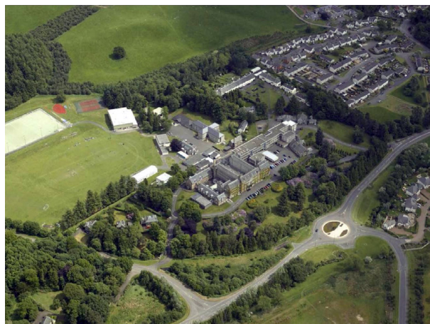
Aerial view of the school, 2006