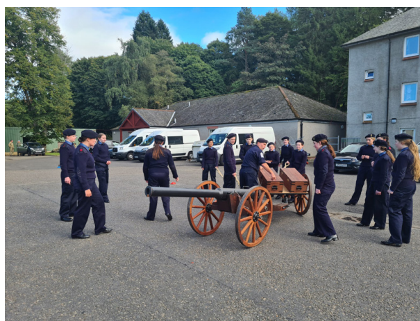
Combined Cadet Force training