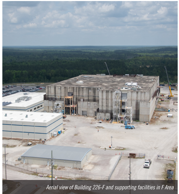
Aerial view of Building 226-F and supporting facilities in F Area

In January 2023, the SRPPF project achieved a new milestone as the dismantlement and removal (D&R) phase