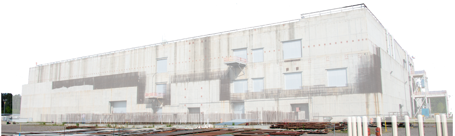
400,000 sq. ft. of available Hazard Category-2 space

Repurposing Building 226-F requires modifications and installation of manufacturing and support equipment directly associated with the pit production mission. Preparations at SRS will also include removing some existing facilities, along with adding new support facilities and modifying some existing ones.