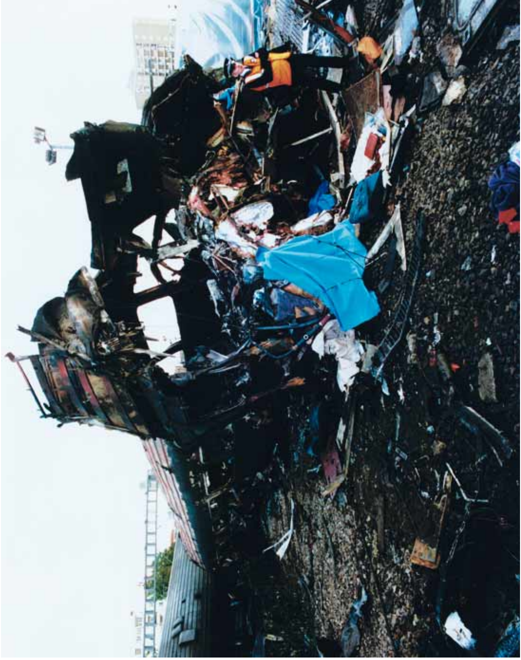
Plate 13: Coach H of the HST: view from the west.