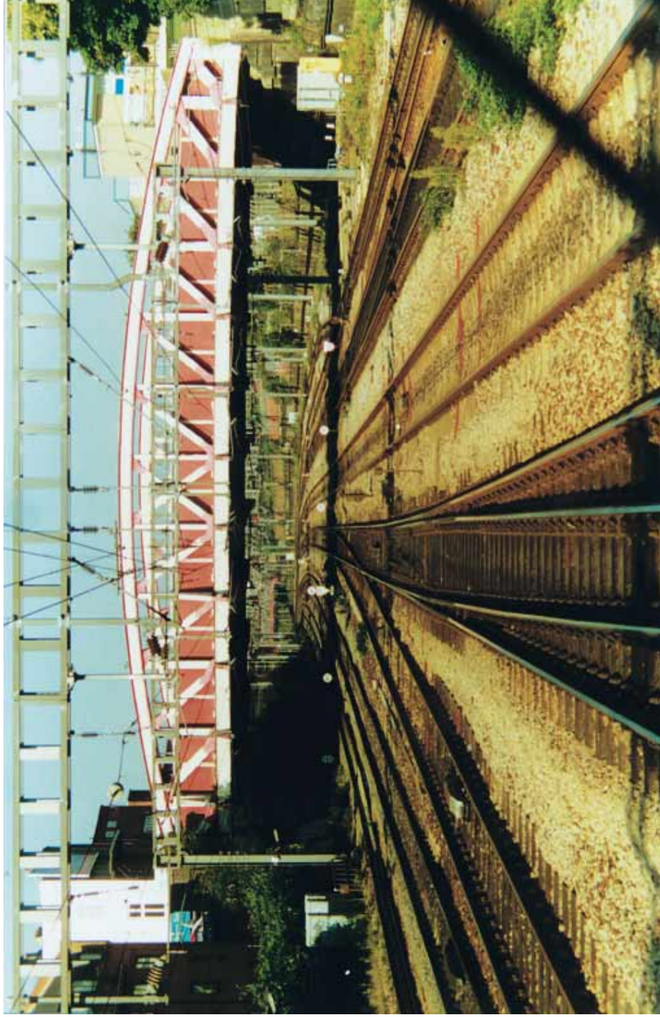
Plate 2: Gantry 8 at a distance of 218 metres. Taken from the driver's position in a Class 165 Turbo on the Line 4 to Line 3 crossover. Its signals, from left to right, are SN107, SN109, SN111, SN113 and SN115. SN105 is carried by a post at the trackside.