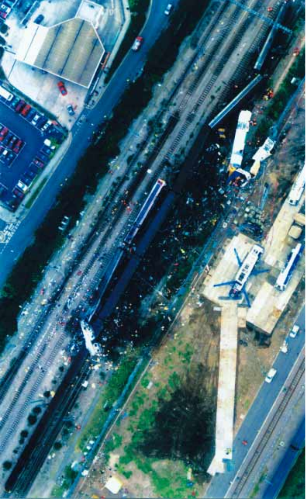
Plate 16: Aerial view of crash site taken on 7 October 1999.