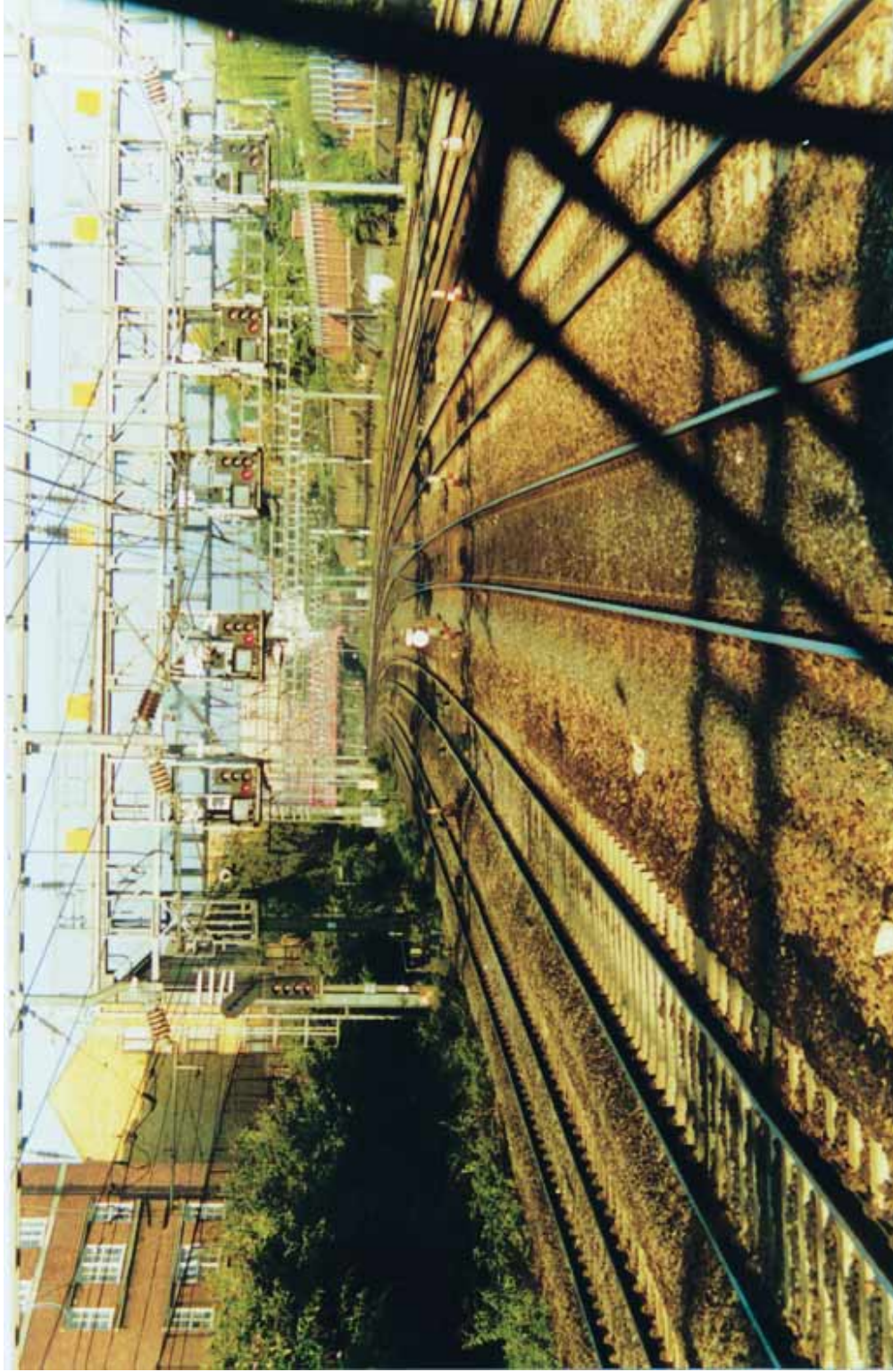
Plate 5: Gantry 8 at a distance of 60 metres. Taken from the driver's position in a Class 165 Turbo on Line 3, under conditions of bright sunlight, at 08:51 on 6 October 1999.