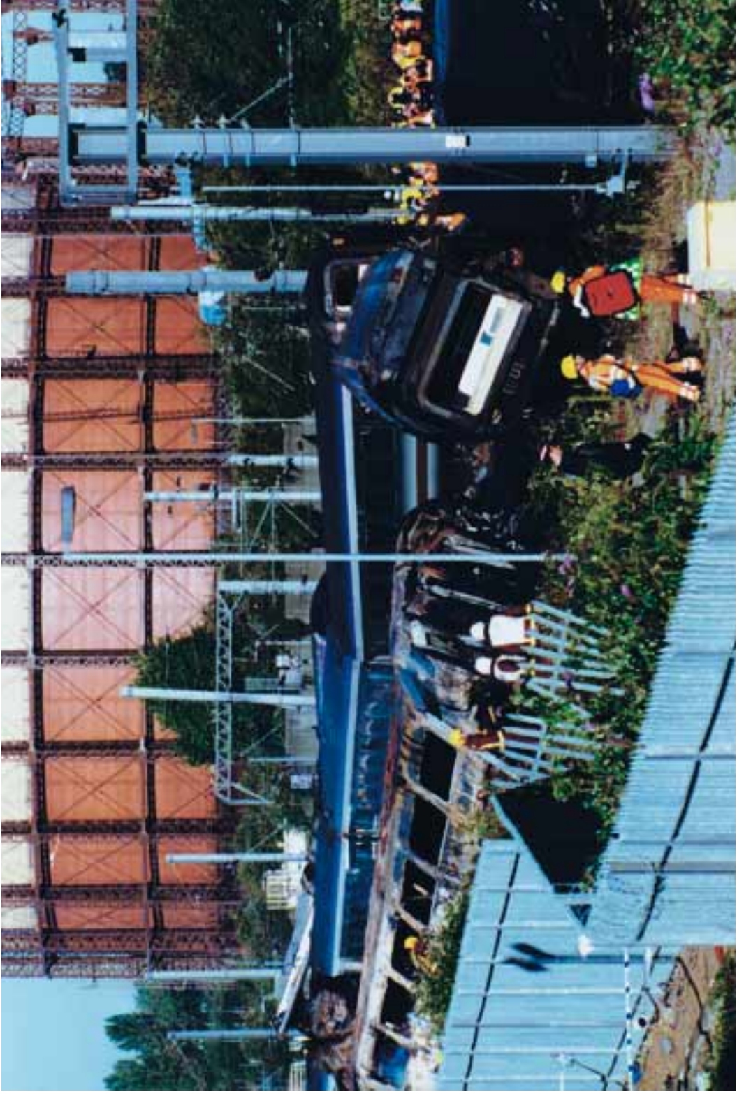
Plate 11: Crash site showing coaches F and H of the HST: view from the south-east.