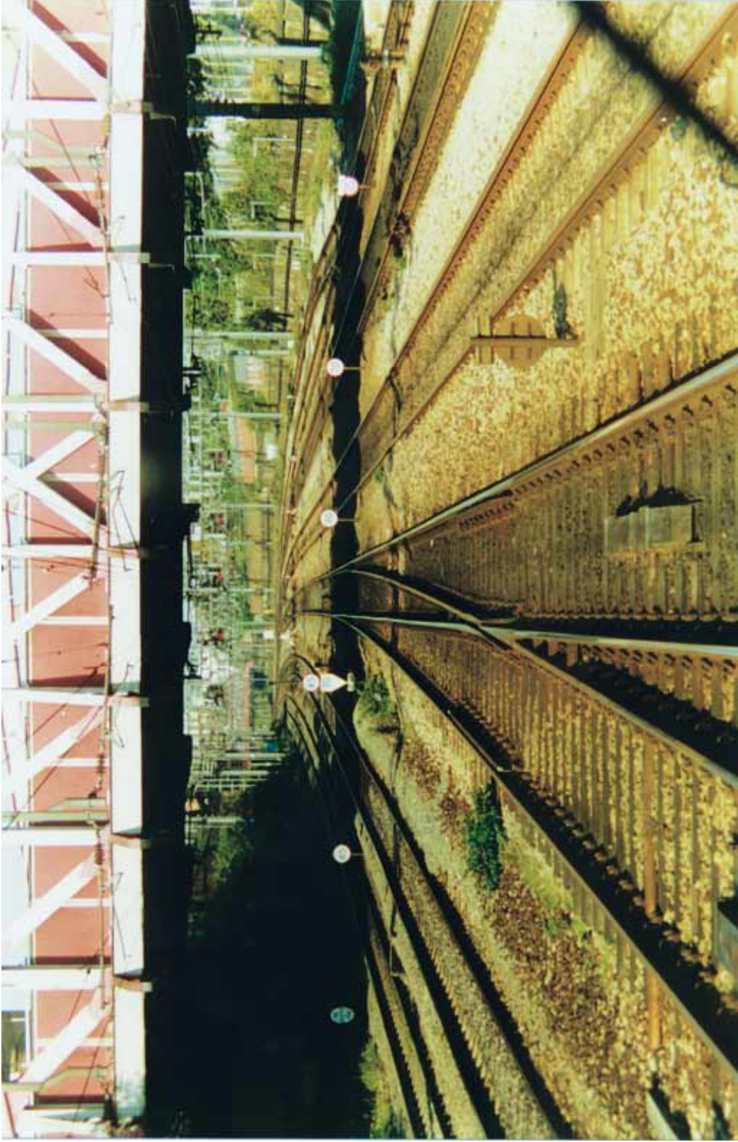
Plate 4: Gantry 8 at a distance of 168 metres. Taken from the driver's position in a Class 165 Turbo on Line 3.