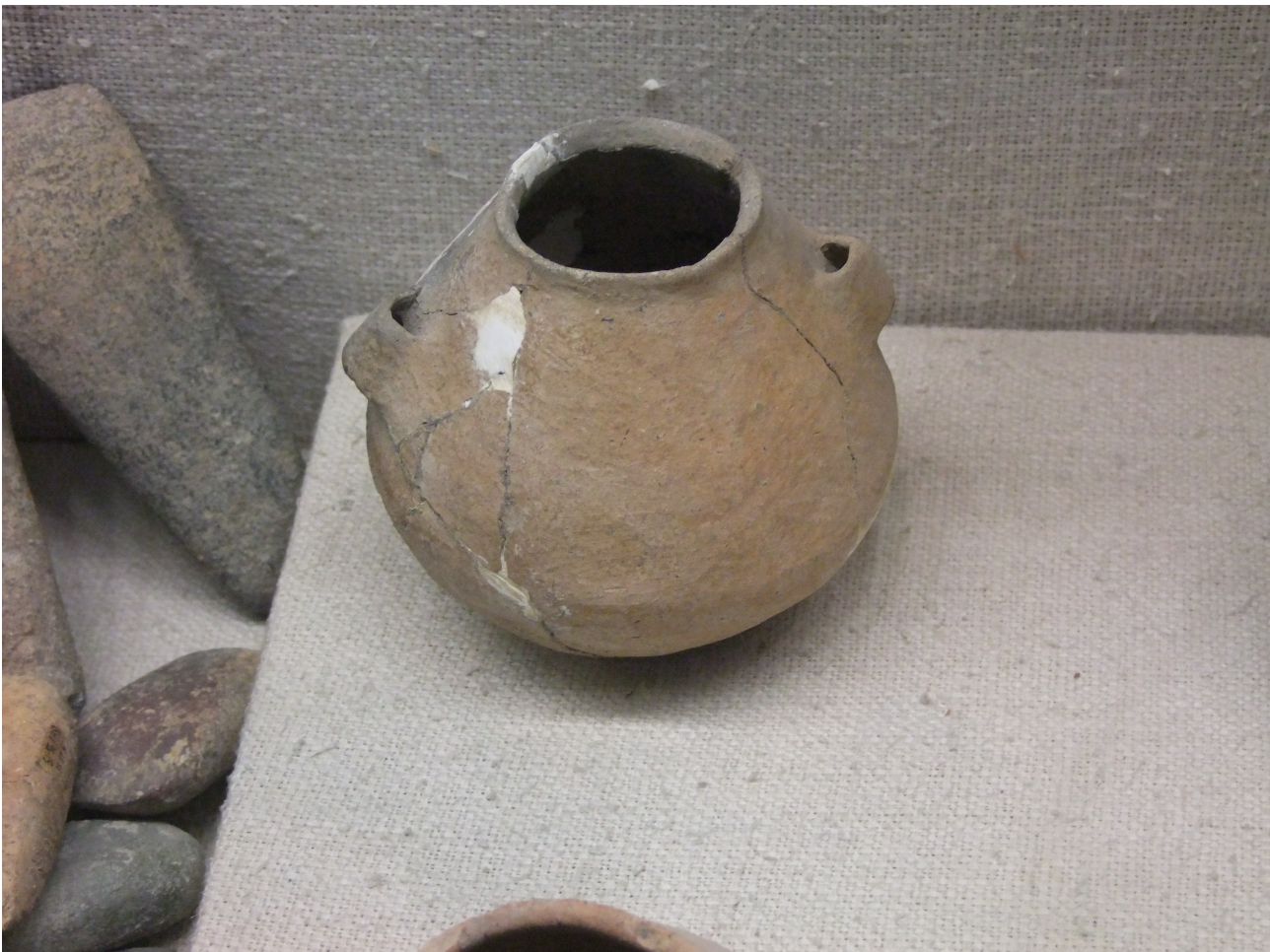
Fire pot dated at c.5800BC and preserved in the Antalya museum which is close to the Adriatic end of the Silk Road.

Fire has been exploited by man since prehistoric times and appears in all known civilisations. The means of making fire varied with different cultures but, until the mid 18th C, it was universally a slow and laborious process. It is no surprise, therefore, that early man, particularly nomadic peoples, developed a simple means of transporting a small source of fire from which he could rapidly kindle a flame when needed 2 . This was the Firepot, a small clay pot holding glowing charcoal. At a time when fortifications were often a wooden stockade and roofs were thatched, it was an obvious ploy to lob firepots at your enemies defences 3 . It would have been suspended from leather thongs in normal use to avoid setting fire to adjacent materials and these provided a very effective means of throwing in the manner of a slingshot. An impromptu experiment indicates that a range of 30 yards or more was easily attainable at a first attempt with surprising accuracy.