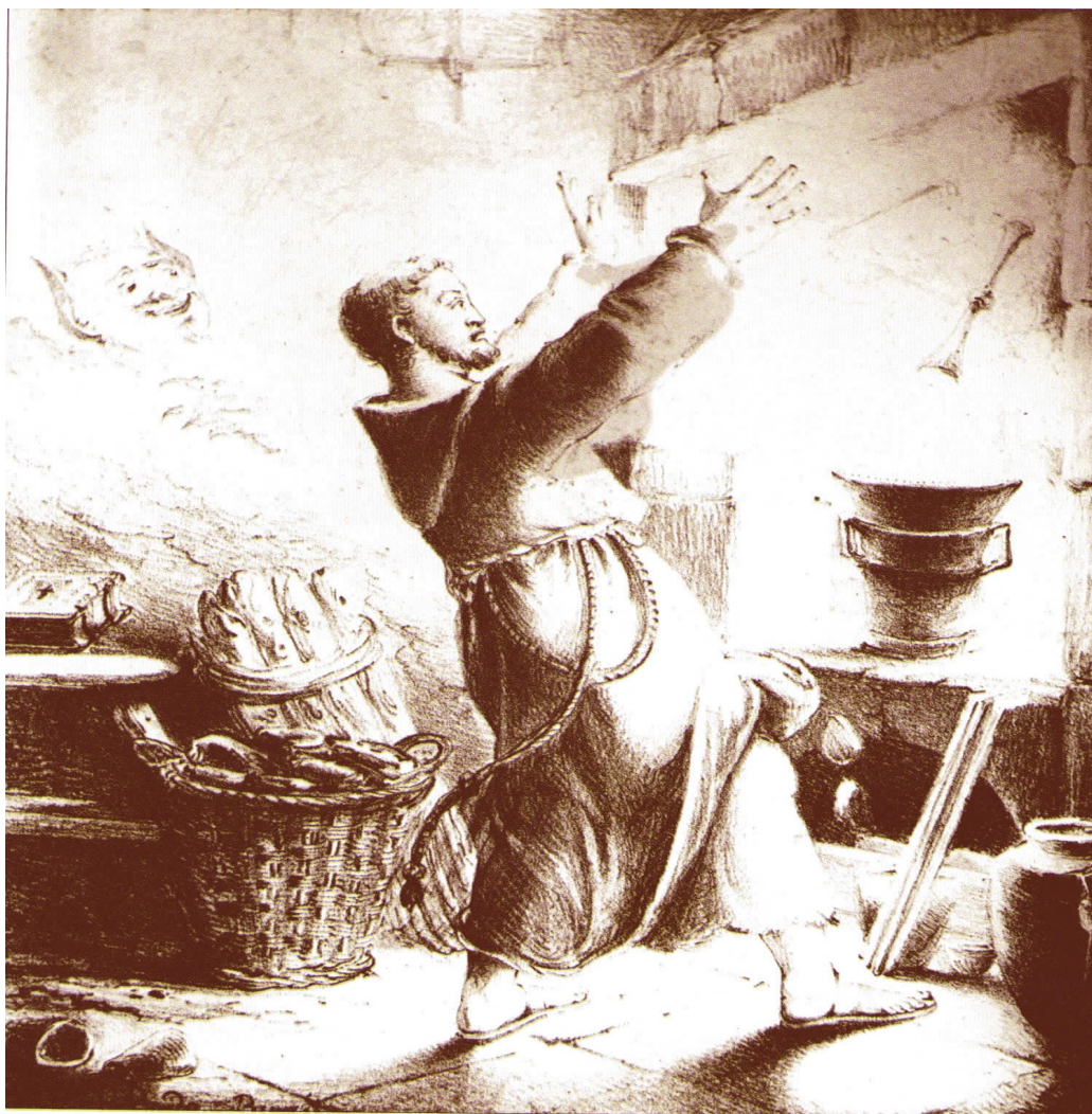
Berthold Schwarz discovers gunpowder

There is a Chinese tradition that a cook carrying a bowl of saltpetre slipped and dropped it onto a charcoal fire. That would certainly create a considerable conflagration but, as the ingredients were not mixed, hardly an explosion. We should also question what the cook was doing with the saltpetre. At that time it was an expensive commodity largely used in the extraction of metals but not common in Chinese cooking. Again, the presence of sulphur is not explained.