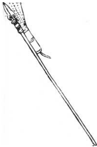
Ho Qiang from a 10th century A.D. Painted Silk Banner

If we make the, not unreasonable, assumption that with bamboo, commonly used for containers might be used as a disposable fire pot, it becomes apparent that, not only is the enhanced mixture not extinguished by being cut off from air, but it can eject flame for a considerable distance. This flaming tube can be pointed or thrown at the enemy or be tied to a spear and used for defence or attack. The Fire Lance is born, the Huo Qiang iv