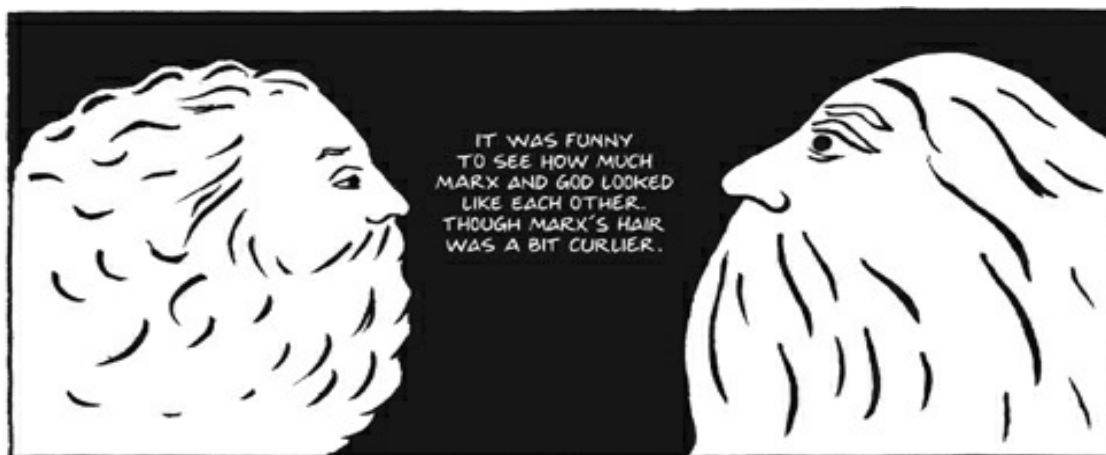
Figure 1 ( Persepolis 13)

In addition to the sympathy for Western ideologies and philosophers, the main character rejects symbols and customs of Islamic women, especially the veil, which complicates her female identity as an Iranian woman. Jennifer Heath affirms that “In the West today, the veil is rarely treated as a traditional or sacred custom but is perceived almost entirely politically” (6). This argument can be applied to the protagonist’s perception of the veil, because she sees it as a political