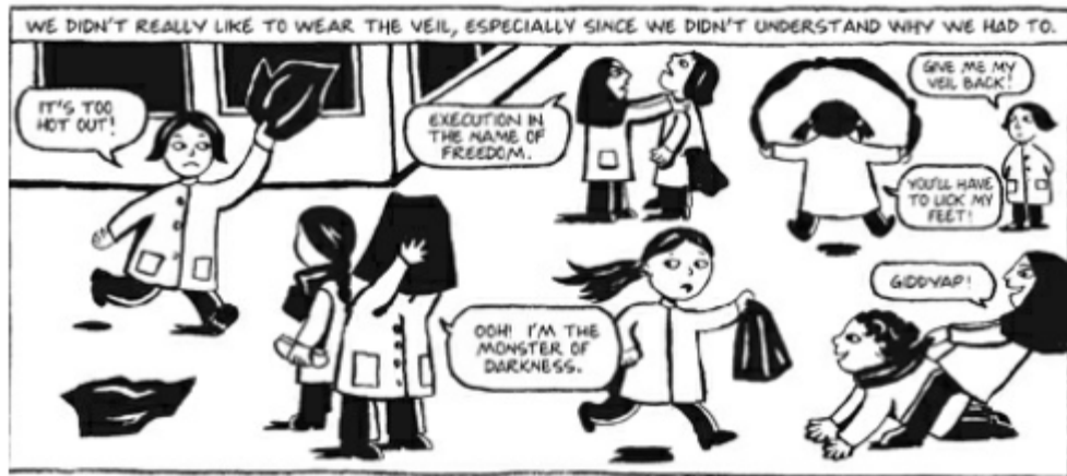
Figure 9 ( Persepolis 3 )

because she was diabetic ( Persepolis 108-110). Satrapi, thus, reveals diverse identities and forms of conceiving Iran, where many people are not submissive or aligned to the imagined nation imposed by the regime. Instead, they reject Iranian Government and look for different ways to cheat, repel and evade it, contradicting the Orientalized stereotype about the submission and passivity to dictators and religious extremists in the Middle East.