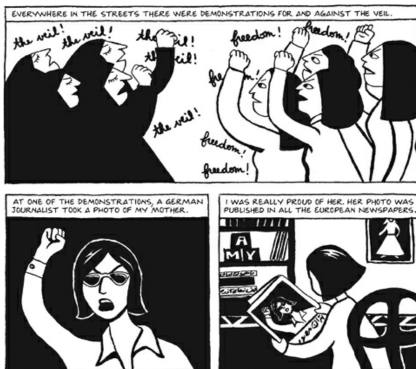
Figure 3 ( Persepolis 5)

Nevertheless, going back to the second question and Spivak's quote, the insurgence of Iranian women in Satrapi's work can be seen as a Western imperialist notion that creates the illusion of female freedom in Eastern women, in order to make them defenders of the Occidental