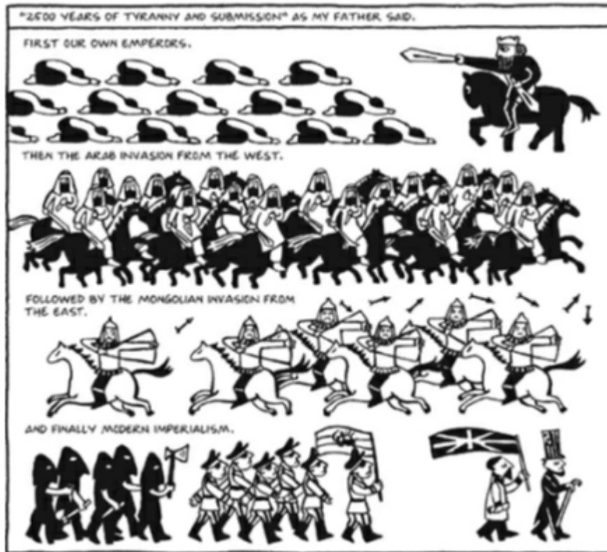
Figure 8 ( Persepolis 11)

Satrapi's father tells her that Iranian people have lived "2500 years of tyranny and submission" (11) and she explains in images the different absolutisms throughout the history of Iran until arriving to the "modern imperialism" 7 ( Persepolis 11) (Figure 8). Although the father's quote shows the tendency to dictatorships as a feature of the Iranian national identity, throughout the content of both comics it can be seen how the Iranian society challenges the absolutist power in everyday life. For instance, in Persepolis the girls in the school do not respect the veil and they use it as a toy (Figure 9), people make midnight parties with alcoholic drinks, even though they were prohibited ( Persepolis 106), and the protagonist's grandmother deceives an officer who wanted to arrest Satrapi's father on the street, making him believe that she had to go home urgently