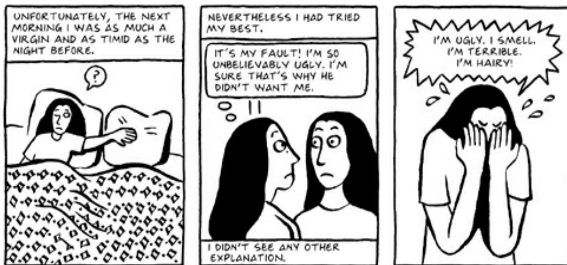
Figure 5 ( Persepolis 2 59)

In addition to the resemblance to the first and second waves of Western feminism, Persepolis and Persepolis 2 can also be related to Spivak's image about "the 'third-world woman' caught between tradition and modernization" (306). The main character of both graphic novels represents a modern Iranian woman who, despite liking Western pop music, Marxist ideology, democracy and women's freedom; does not separate from her cultural roots. Her family and ancestors, for instance, are transcendental in her life. This can be observed in Satrapi's happiness