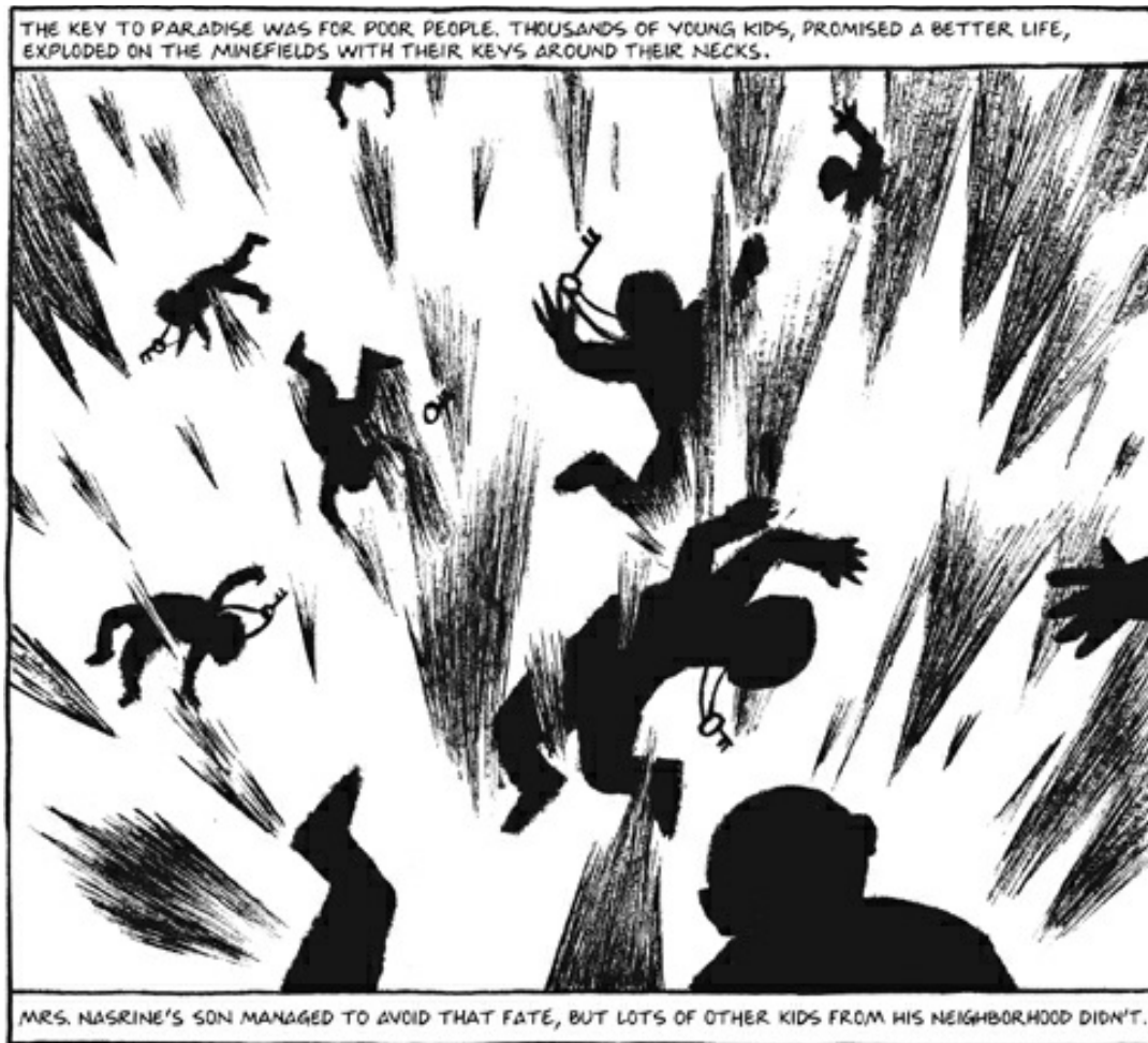
Figure 11 ( Persepolis 102)

It might appear that both comics refuse the Iranian national identity because they disapprove regime's nationalism. However, as Navdeep Kahol explains in her text "Redefining Nationalism: Contemporary Memoirs by Expatriate Iranian Women", Satrapi's work "urges the reader to dissociate the identity of a nation from its government and religion and from the extremists they foster" (18) and it is against the Islamic nationalism that "was offered as an antidote to westernization denounced as West-toxication" (19). In spite of severely criticizing the Islamic nationalist regime, the protagonist also disapproves Mohammad Reza Shah, which encouraged country's Westernization, because her family considered him authoritarian and unfair. In fact, when the dictator leaves the country due to the Islamic Revolution, Satrapi says that there was the biggest celebration in the history of the nation ( Persepolis 41). As the plot progresses, the reader can perceive how the substitute government is more pernicious than the predecessor.