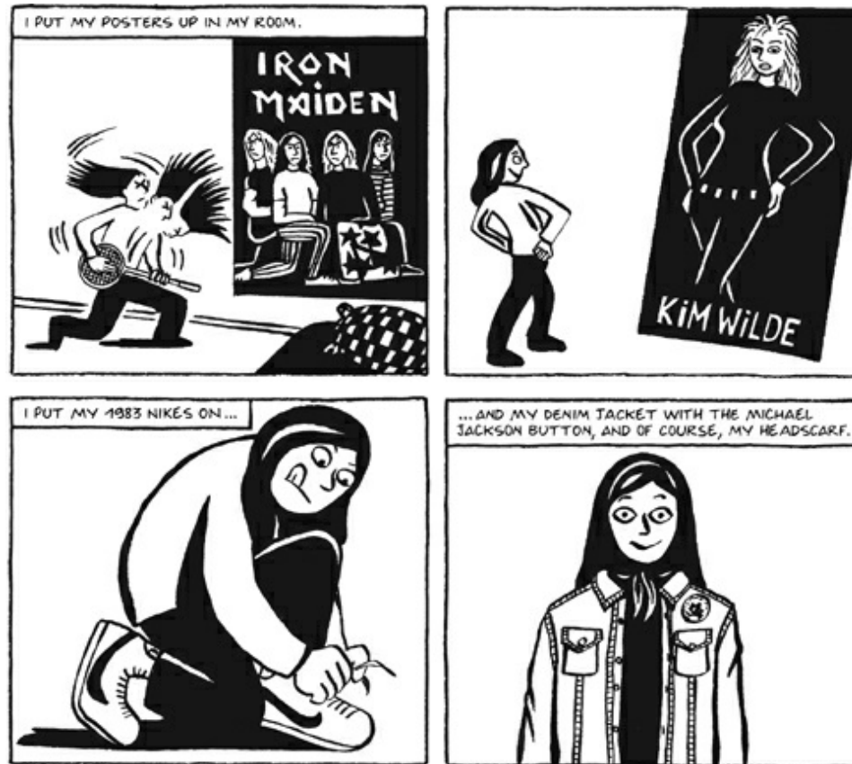
Figure 4 ( Persepolis 131)