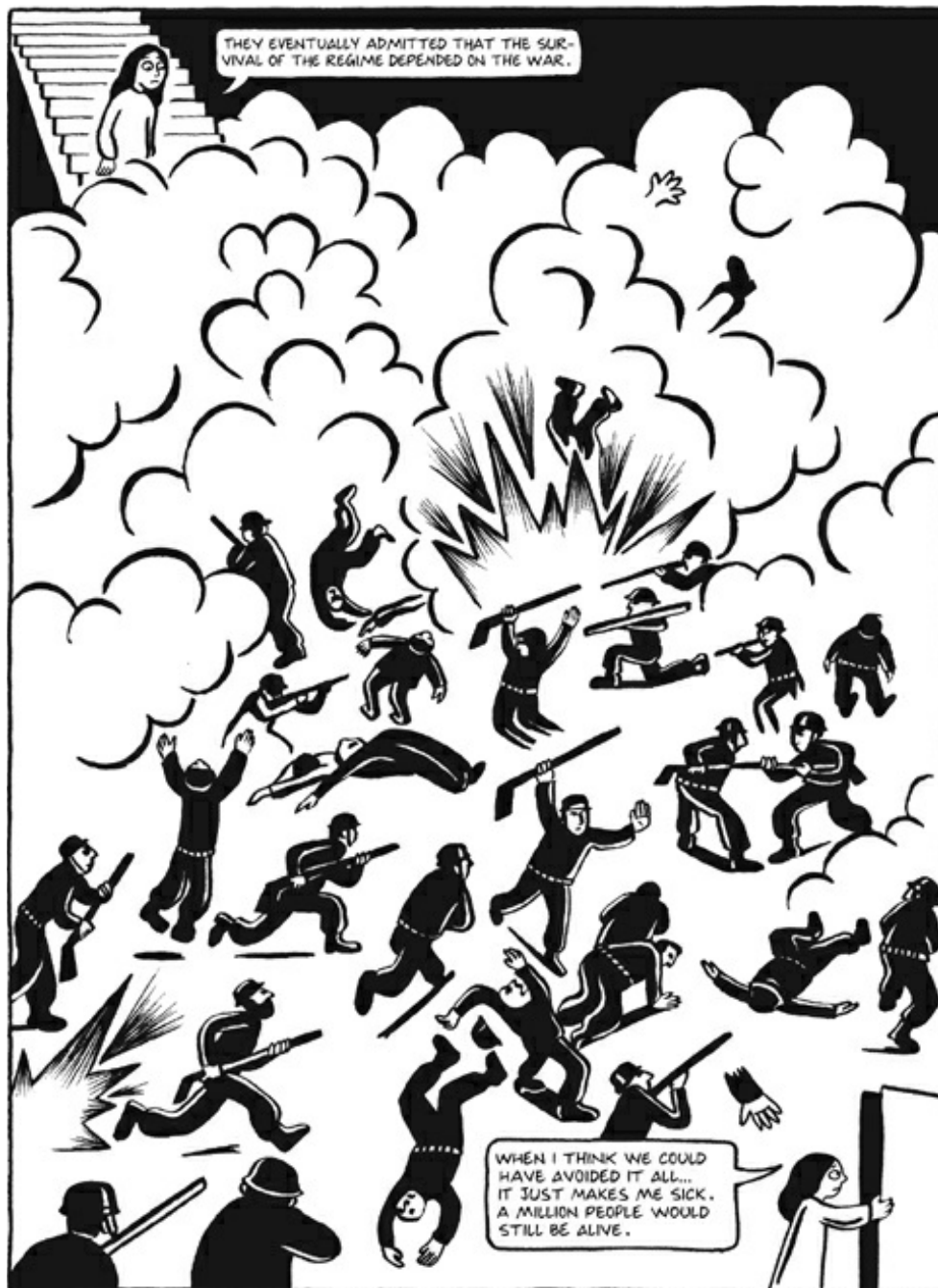
Figure 10 ( Persepolis 116)