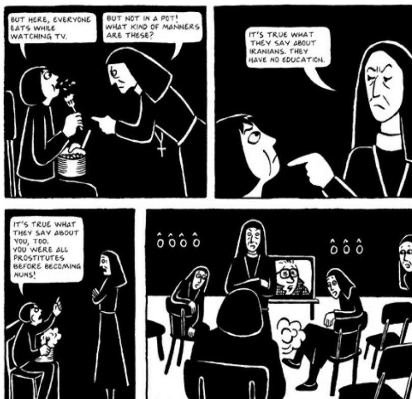
Figure 7 ( Persepolis 2 , 23)

Austria and suffers serious consequences for it. This can be clearly observed in the chapter called “Pasta” of Persepolis 2 . In this episode, she lives in a residence of Christian nuns and watches television in the living room, while eats from a pot full of pasta. Then, the superior nun reproaches her saying: “What kind of manners are these... It’s true what they say about Iranians. They have no education” (23) (Figure 7). It can be seen how the nun uses the binary division of civilization-barbarism to establish that Austrians (and, thus, Westerners) are civilized people,