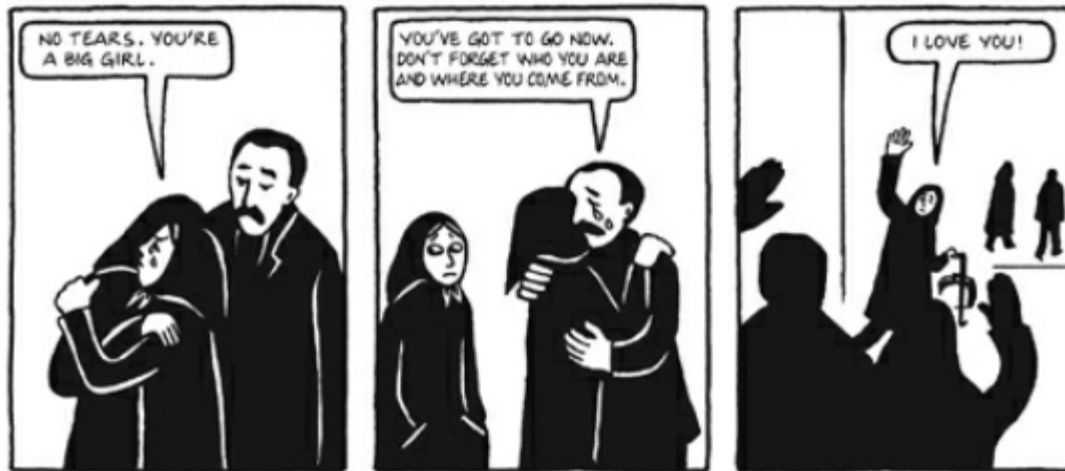
Figure 6 ( Persepolis 152)

when she knows that her grandfather was a prince who was later overthrown, confiscated and imprisoned (22-24); and in her family sadness when she leaves her home to study in Vienna (152) (Figure 6). In fact, her father tells her, “Don’t forget who you are and where you come from” (152). The protagonist fits then in Spivak’s argument because she is between her family—which represents her country and native culture—and the West cultures, values and feminism.