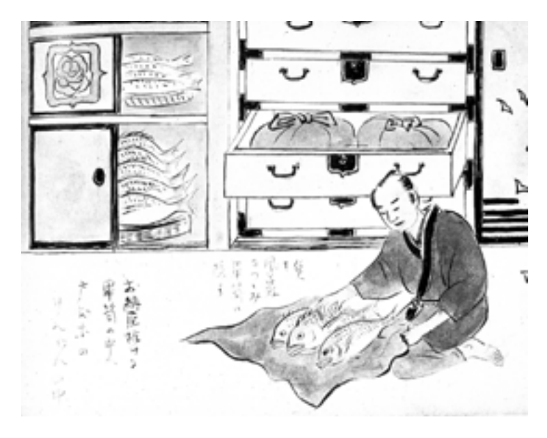
Figure 27. Hiding fish to avoid the tax collector. Sketch by Mori Kazan.

the political and economic power of the Tokugawa regime was in serious danger of collapse. In the face of rising debts to the merchant classes, the Tokugawa regime systematically debased the currency nineteen times between 1819 and 1837. Samurai stipends (paid as fixed amounts of rice) had long since fallen behind inflation. The regime's dependence on the despised merchant classes clashed with its attempts to reexert feudal control over what had become a highly sophisticated domestic economy (see Schaede 1991; Hanley 1997). During the Tempō era (1830–44), reformers within the shogunal government tried to purify the economic system of endemic corruption and to revitalize the political regime. Among many other measures, in 1841 the shōgunate revoked the system of feudal monopolies and ton'ya licensing. This reform was expected to lower prices; instead, the result was wild speculation in commodities, massive inflation, and general economic chaos. In 1851 the authorities reinstated the monopolies and guilds. Throughout this economic turmoil, the shogunate retained the jono system, and Nihonbashi's dealers remained obligated to supply the castle with the finest catches. But the larger political and economic problems of the Tokugawa regime continued to worsen and in the 1850s and 1860s, rebellious clans began to rally against the Tokugawa regime in a movement to depose the shogun and restore imperial rule.