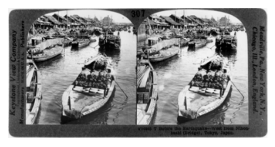
Figure 28. "Before the Earthquake—West from Nihonbashi (Bridge), Tokyo, Japan." American stereopticon slide, ca. 1925 (Keystone View Company, no. V14945).

emy. Eventually the municipal government and a majority of the Nihonbashi traders concurred that here a new, permanent marketplace would be erected. Meanwhile, immediately after the earthquake, a die-hard anti-relocation faction of Nihonbashi dealers attempted to reopen for business at Nihonbashi, with permission granted by a local police official. For several days they operated amid the rubble until the municipal government forcibly closed the marketplace for good. The police official who granted permission to the diehards to reopen at Nihonbashi was summarily transferred to Hokkaidō, the shops were closed, and some disgruntled Nihonbashi dealers left the fish business forever (Takarai 1991: 97–98).