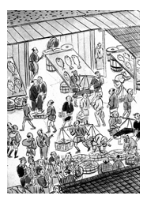
Figure 26. The daily bustle of the Nihonbashi market during the Tokugawa period. Sketch by Mori

important respects, the Nihonbashi market that developed was new and not simply a continuation of its predecessors.