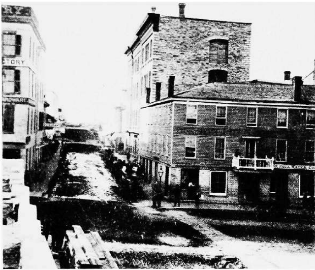
THE NEW St. Paul Water Company at Jackson and Third streets in 1869; in the left foreground, the wall of the St. Paul Fire and Marine Insurance Company, is under construction.