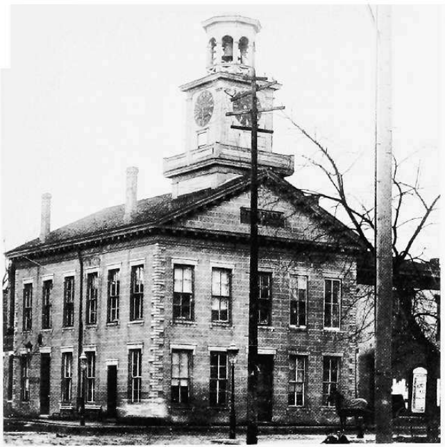
ST. PAUL'S City Hall, built in 1856, housed the police department (1891 photo).

adopt the license system. It is an evil that must be looked in the face, and not handled with kid gloves.” 16