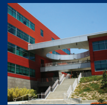
MSA / MSB