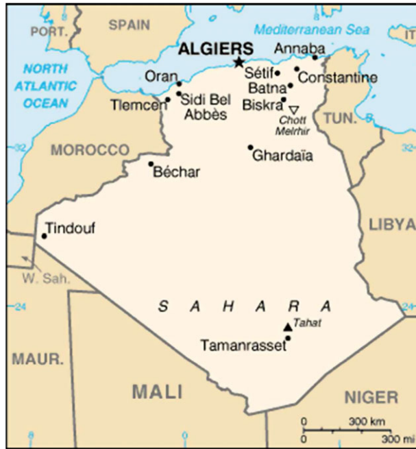
FIGURE 1 Map of Algeria [Colour figure can be viewed at wileyonlinelibrary.com ]

The Arab-Islamic period began in 647 AD when Arabs conquered the Christian Byzantine Empire in the Maghreb. The indigenous local Berber populations were Arabized throughout the centuries partly 'because Islam brought with it a strong language, a great literary culture and a relatively advanced system of administration and education' (Ennaji, 2005: 17). Many Berbers gradually moved to cities, spoke a local variety of Arabic, and started identifying themselves as Arabs and Muslims (Ennaji, 2005). The French colonized Algeria from 1830 to 1962, while imposing a protectorate on Morocco and Tunisia for a while during this period (Ennaji, 2005). It is worth noting here that while colonization refers to a total control of Algeria and its annexation with France, the protectorate implies some degree of autonomy for the locals in Morocco and Tunisia. Algeria, in fact, was a department of France. Like the Arab-Muslims before them, the French brought advanced administration and education systems. Unsurprisingly, among all of the Maghreb's conquerors, the Arabs and the French have had the greatest impact linguistically and culturally due to bringing these advanced educational and administrative systems and working towards imposing them long-term (Ennaji, 2005).