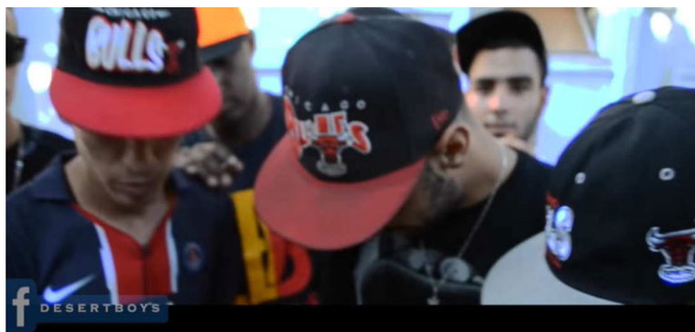
FIGURE 2 Algerian Desert Boys rap band wearing Chicago Bulls hats [Colour figure can be viewed at wileyonlinelibrary.com ]