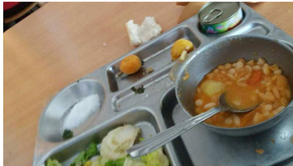
FIGURE 4 A post prompting a discussion of student campus life in Algeria [Colour figure can be viewed at wileyonlinelibrary.com ]