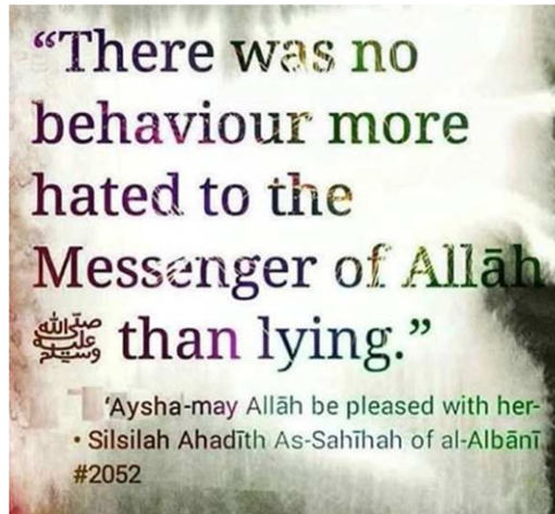
FIGURE 3 An example of the use of English for religious purposes [Colour figure can be viewed at wileyonlinelibrary.com ]