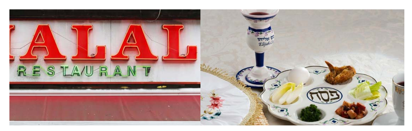
Diffen > Philosophy > Religion > Judaism

Halal and Kosher are terms often heard in the context of meat and dairy, and although it's common knowledge that the terms refer to guidelines on what can be consumed and what cannot, few know what either really means, let alone how they differ. "Is this kosher?" has become a common expression that has transcended the context of religion and food to the point that it simply means "Is this acceptable?" in a colloquial sense.