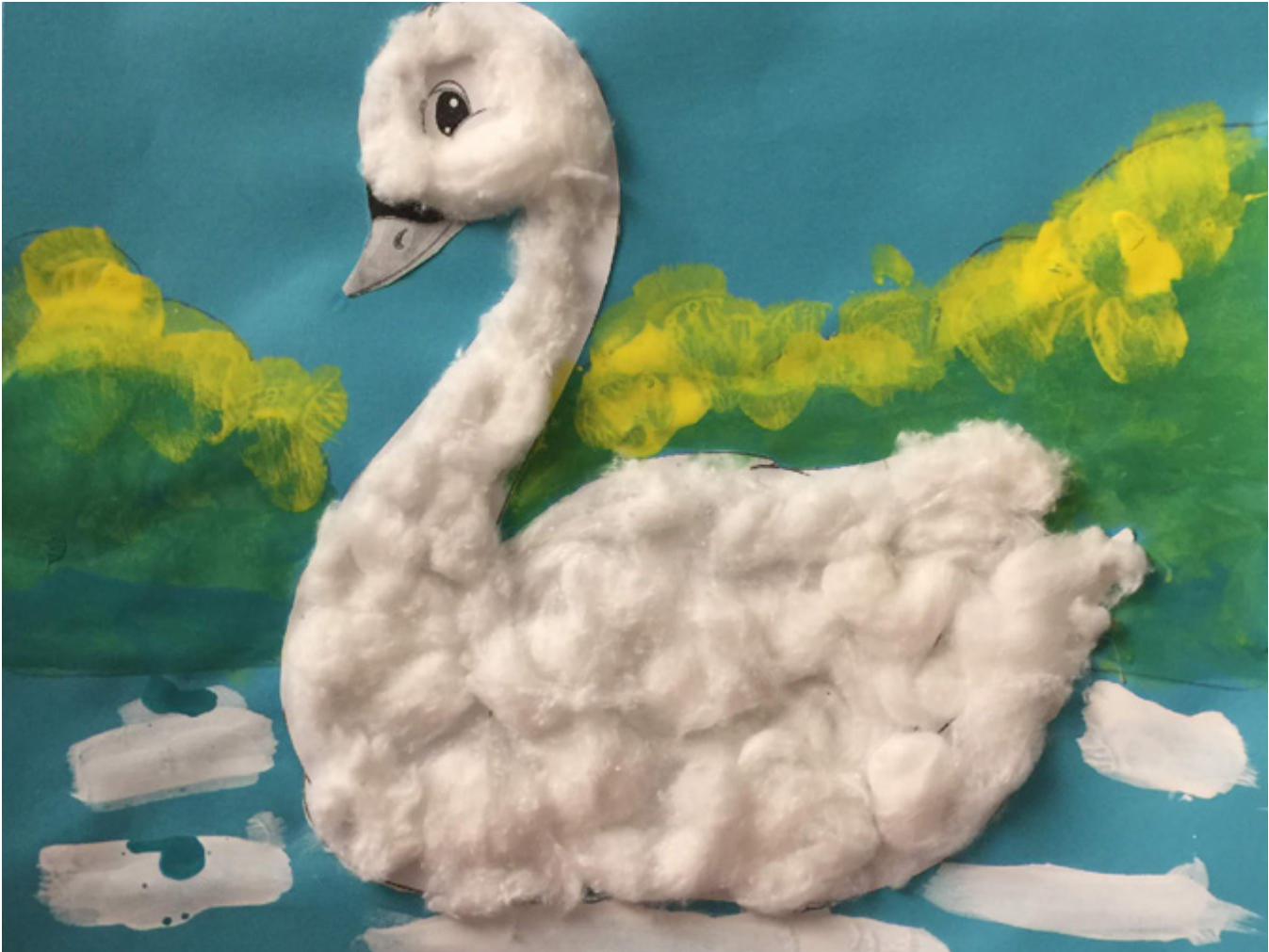
Artist: Student Artist Art Teacher: SoYoung Park-Bovee

Delaware Code Title 14 Del. C § 4110 Disturbing schools or destroying school property; penalty Whoever disturbs a public school in session or willfully destroys any public school property shall be fined $20, to be collected as other fines, and paid to the board of education of the school district for the benefit of the respective district, or imprisoned not more than 30 days, or both. (32 Del. Laws, c. 160, § 57; Code 1935, § 2752; 14 Del. C. 1953, § 4113; 57 Del. Laws, c. 113.)