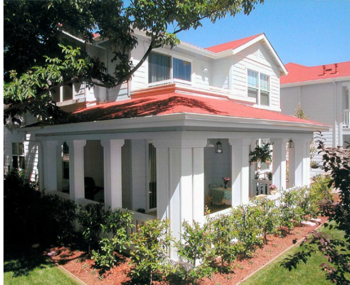
20000196 & 20060346