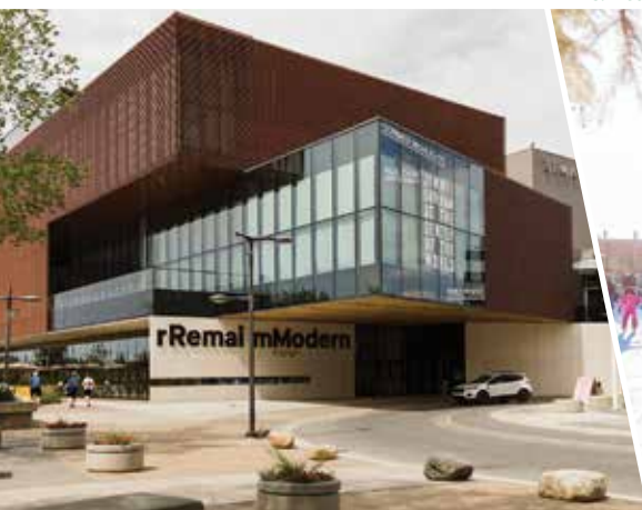
▽ Remai Modern art museum