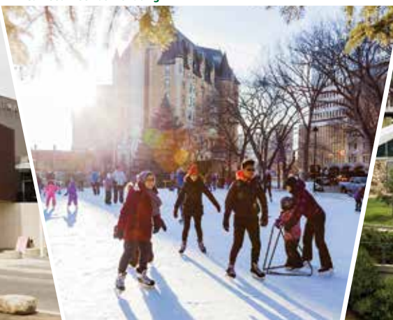
▽ Cameco Meewasin Skating Rink