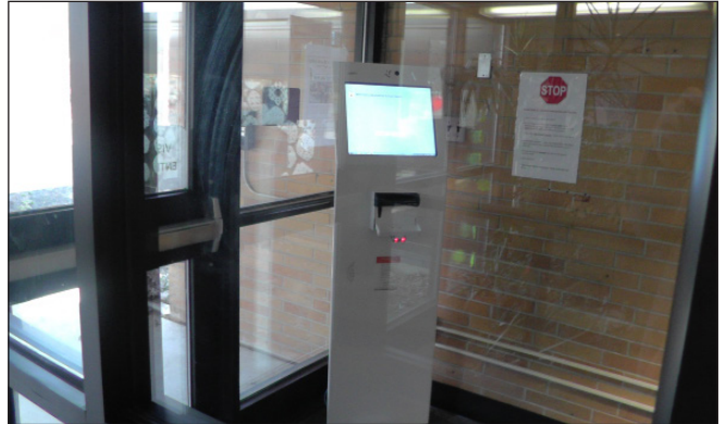
New security vestibule at Herbert Hoover ES