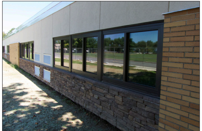
Energy-efficient windows at Herbert Hoover ES