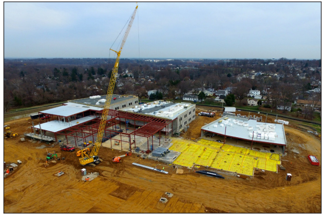
New Tawanka Elementary School building