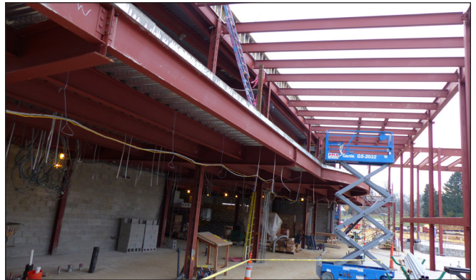
Interior 'Main Street' at the new Tawanka building