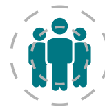
TRADE AREA POPULATION