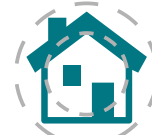
TRADE AREA HOUSEHOLDS