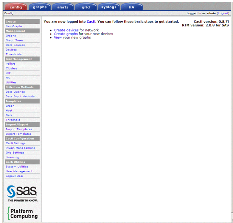
Figure 1: Platform RTM for SAS home screen

Not part of the SAS Grid Manager installation but available from the SAS Support website is Platform RTM for SAS - a boon for LSF "Newbies": "A web-based tool that enables you to graphically view the status of devices and services in a SAS grid environment as well as manage the policies and configuration of the grid." Although LSF can be configured & run from the command-line & direct manipulation of text-based configuration files, the RTM GUI is very simple to use to configure & monitor an LSF cluster.