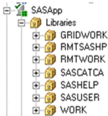
Figure 3: SAS libraries in a Grid-enabled Enterprise Guide session

In a Grid-enabled environment, you will now notice a new set of libraries. These arise from SAS/Connect's Remote Library Services (RLS) surfacing the libraries of the remote SAS session(s) to the SAS client, as well as one very grid-focused library called (not surprisingly) GRIDWORK.