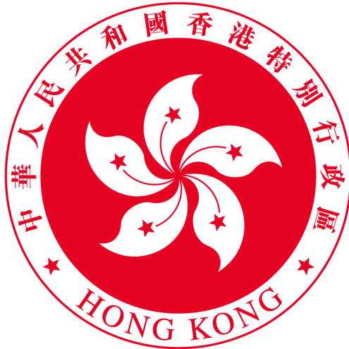
The Design of the Regional Emblem of the Hong Kong Special Administrative Region