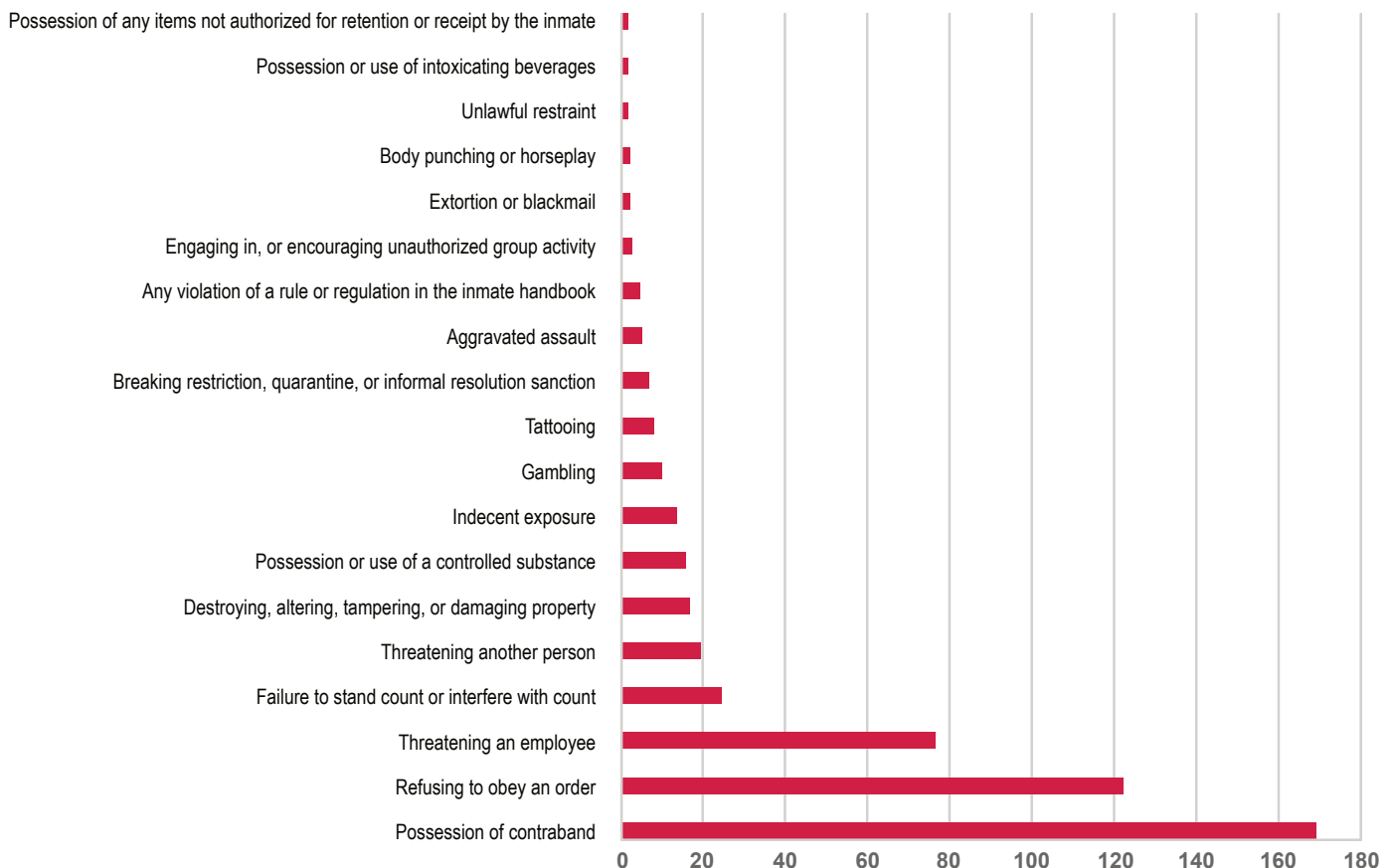
Figure 1. Total number of each misconduct across cases, as reported to the District Attorney's Office by the Department of Corrections

The modal number of misconducts reported was 7 (ranging from 0 to 107). On average, the last incident reported was approximately 8 years prior to resentencing (ranging from 1 to 31 years). Figure 1 shows the type and number of misconducts reported, aggregated across all cases 8 .