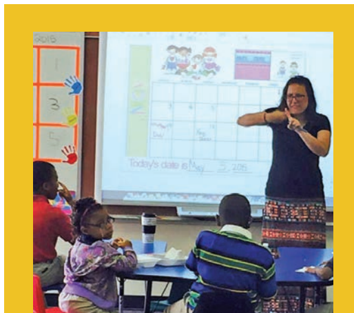
Each classroom is equipped with a SmartBoard, iMac, iPad and visual public announcement system.

To ensure student exposure to communication, we provide support services such as speech therapy, audiological services, counseling, occupational therapy and physical therapy — all based on student assessment.