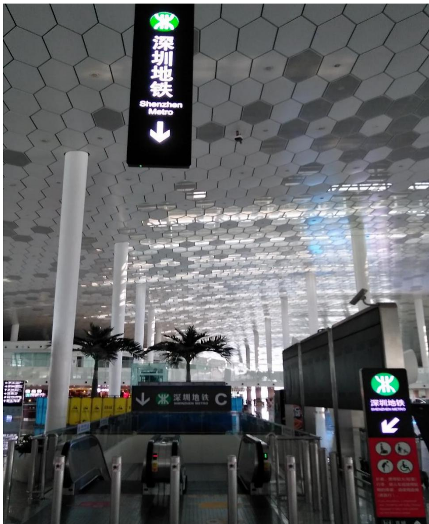
The subway (Shenzhen Metro) station

When you see this board, you are getting closer to the taxi parking/metro.