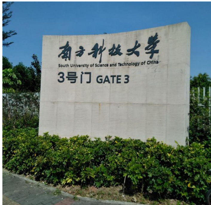
Gate 3 of SUSTech