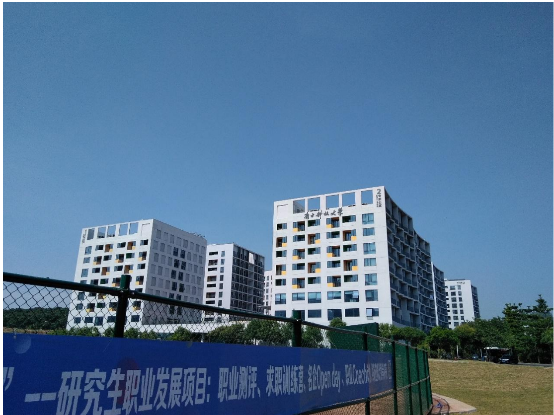
Guest Houses of SUSTech