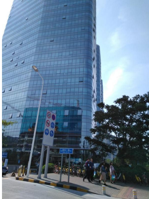
A tall building outside the Gate 3 of SUSTech.