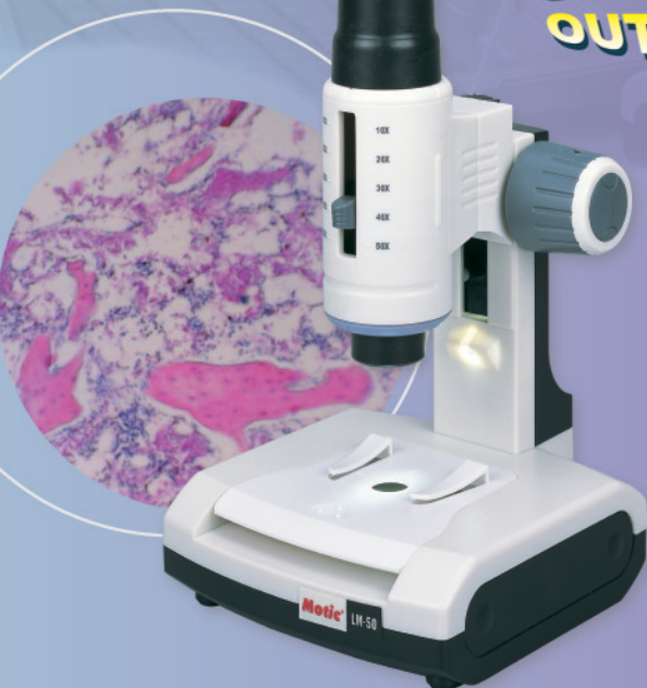
LM-50 For examinations, which do not require the high magnification of the LM-100