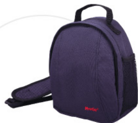
Soft carrying bag