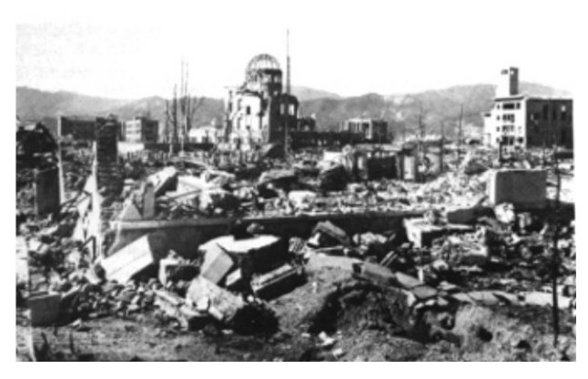
The atomic bombing of Hiroshima

Let us first examine the effect of the Hiroshima bomb. In order to prove that the Hiroshima bomb had a decisive effect on Japan's decision, Asada and Frank use the following evidence: (1) the August 7 cabinet meeting; (2) the testimony of Lord Keeper of the Privy Seal Kido Koichi concerning the emperor's statement on August 7; and (3) the emperor's statement to Foreign Minister Togo Shigenori on August 8.