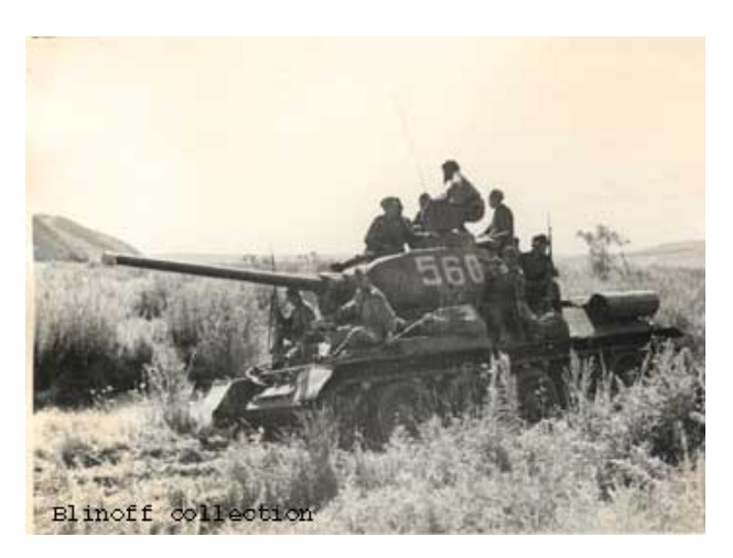
Soviet tanks in Manchuria 1945

Soviet entry into the war had double-crossed the Japanese in two distinct senses. In the first place, the Kremlin had opted for war just when Japan was pinning its last hopes of peace on Soviet mediation. Furthermore, the invasion was a surprise attack. True, Molotov had handed a declaration of war to Sato in Moscow. Sato then asked for Molotov's permission to transmit the declaration of war to Tokyo by ciphered telegram, but the ambassador's dispatch never reached Tokyo. In fact, it never left Moscow, most likely having been suppressed by the telegraph office on the orders of the Soviet government. Molotov announced that the declaration of war was also to be handed by Soviet Ambassador Iakov Malik to Togo in Tokyo simultaneously. But the Japanese government learned of the Soviet invasion of Manchuria only from a news agency report at around 4:00 A.M. on August 9.[72]