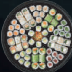
MAKI PARTY - 67 PIECES -