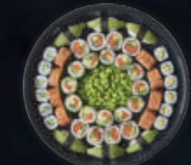
VEGAN VARIETY - 46 PIECES - + EDAMAME

ALL OF OUR PLATTERS ARE HANDMADE ON SITE IN 20 MINUTES. JUST CALL YOUR LOCAL SUSHI DAILY COUNTER OR ORDER WHILE YOU SHOP.