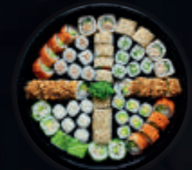
SUSHI FUSION - 61 PIECES - WITHOUT RAW FISH