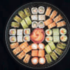
SAKURA PARTY - 54 PIECES -