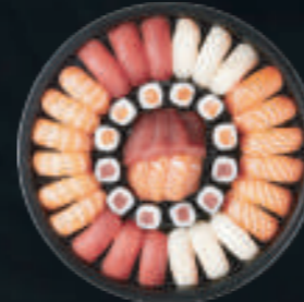
NARA PARTY - 44 PIECES -