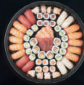
KYOTO PARTY - 58 PIECES -

PERFECT FOR A GET-TOGETHER WITH FRIENDS, FAMILY OR AN OFFICE MEETING