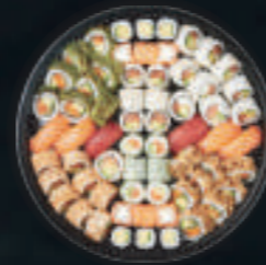
HANABI PARTY - 64 PIECES -