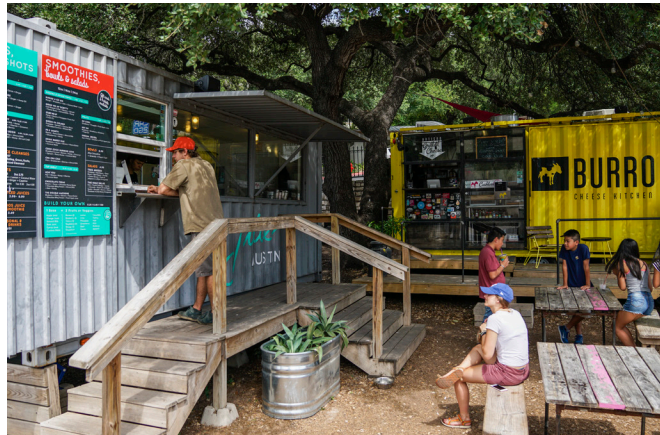
Eclectic Dining and Live Music Venues