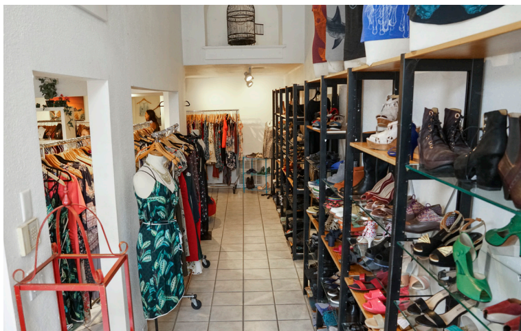
Renowned Boutique Shopping