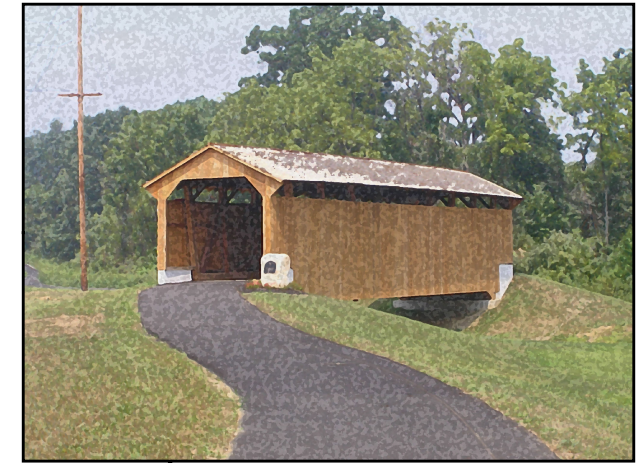
Larkin's Bridge, Byers Station