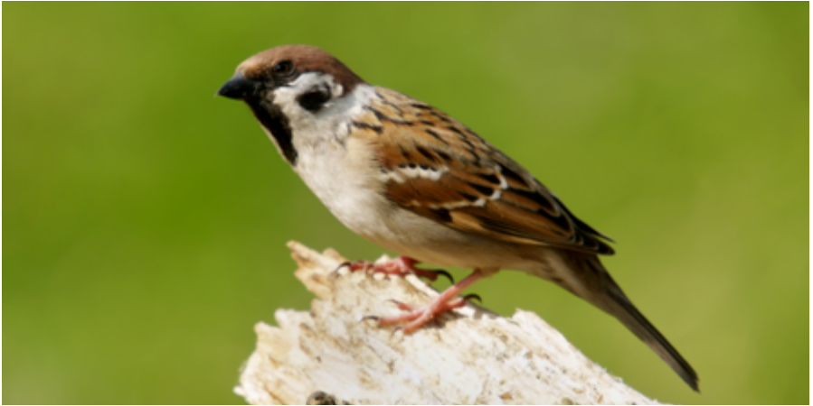
The UK tree sparrow population suffered a severe decline 1970-2008, estimated at 93%

declining populations. In farmland bird species the decline is associated with simultaneous impacting factors, principally including habitat loss: