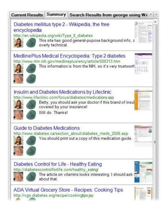
Figure 3. Automatically-generated summaries provide a quick way to access the pages group members identified as relevant.

SearchTogether is designed to enable either synchronous or asynchronous remote collaboration ( e.g. , each participant is in a distinct location, with his own computer). SearchTogether employs a client/server architecture. The server acts as an intermediary for sending shared state among clients, as well as being a repository for storing SearchTogether session data in order to enable session persistence.