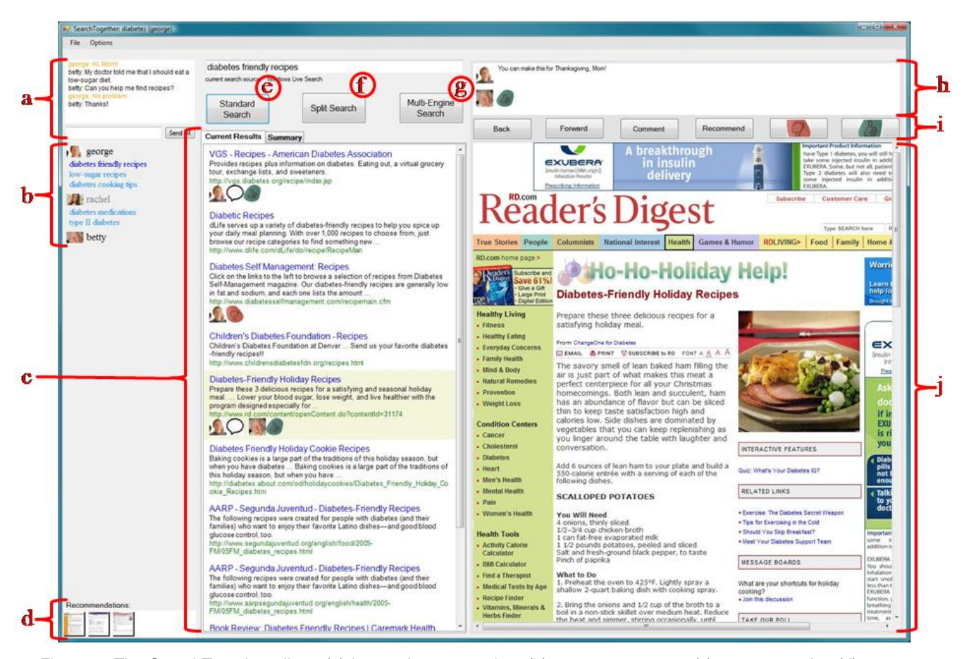
Figure 1. The SearchTogether client. (a) integrating messaging, (b) query awareness, (c) current results, (d) recommendation queue, (e)(f)(g) search buttons, (h) page-specific metadata, (i) toolbar, (j) browser

awareness, division of labor, and persistence, which we discuss in more detail in the following sections.