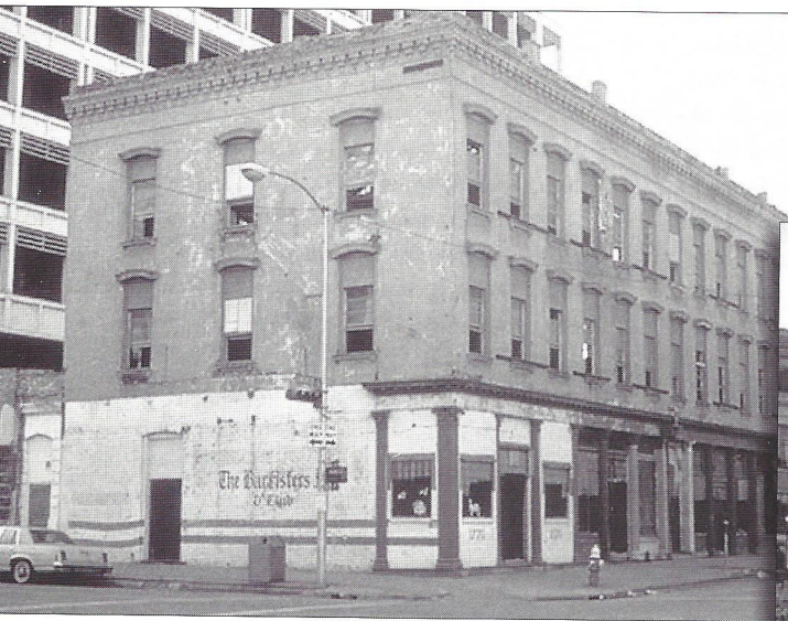
The Pillot Building, one of Houston's oldest commercial buildings located at the corner of Fannin Street and Congress Avenue, was saved after a multiyear effort by members of the Greater Houston Preservation Alliance. The building with its cast iron ornamental detailing collapsed during renovation by The City Partnership, a private development company, and is mostly a reconstruction. The building reopened with a restaurant and offices in 1990.