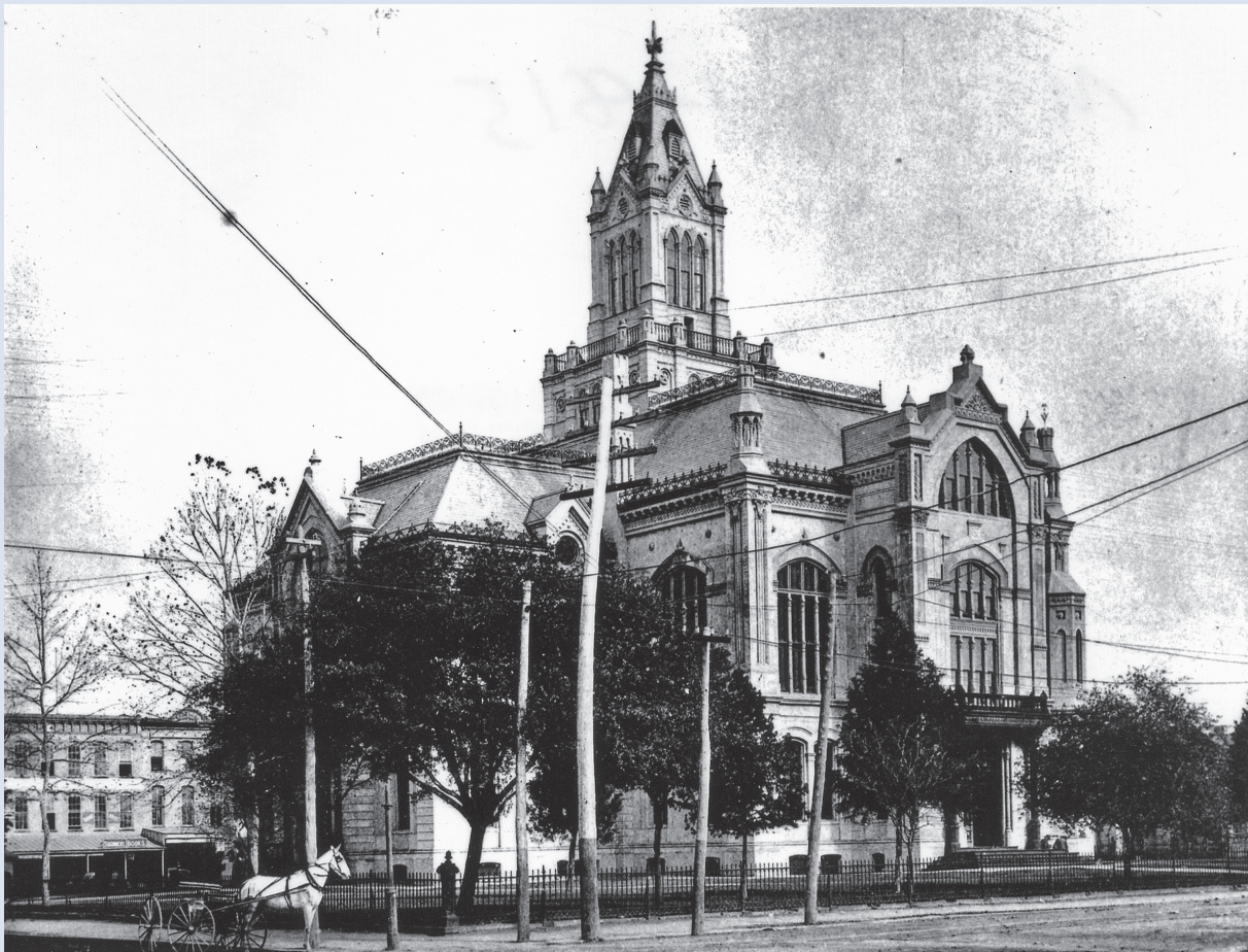
Harris County Courthouse with tower, 1883.