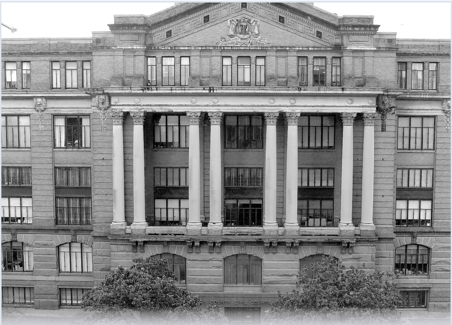
A close-up view of the exterior of the Harris County Courthouse.