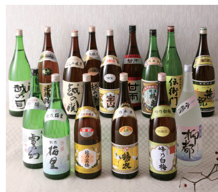
Local sake in Niigata City

Niigata has many attractions besides art.