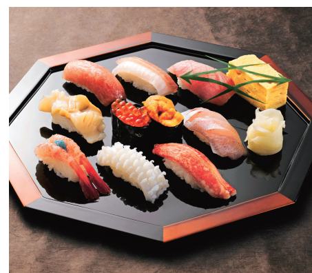
Niigata Sushi Zammai “Kiwami”