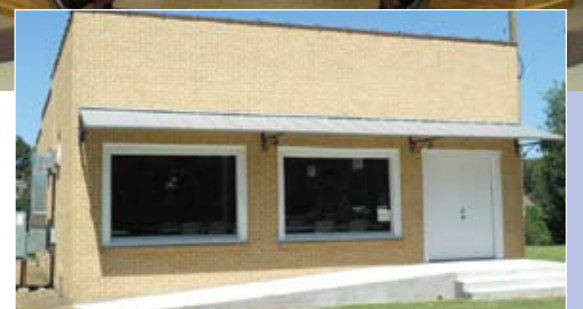
Renovations at a former grocery store, located on Hwy. 77, are now complete and the building is ready for use as Rosedale's Community Center.

a facelift, with a freshly painted council chamber and a new dais where council members will conduct meetings. An unused jail cell has been converted to an office for Rosedale's police chief.