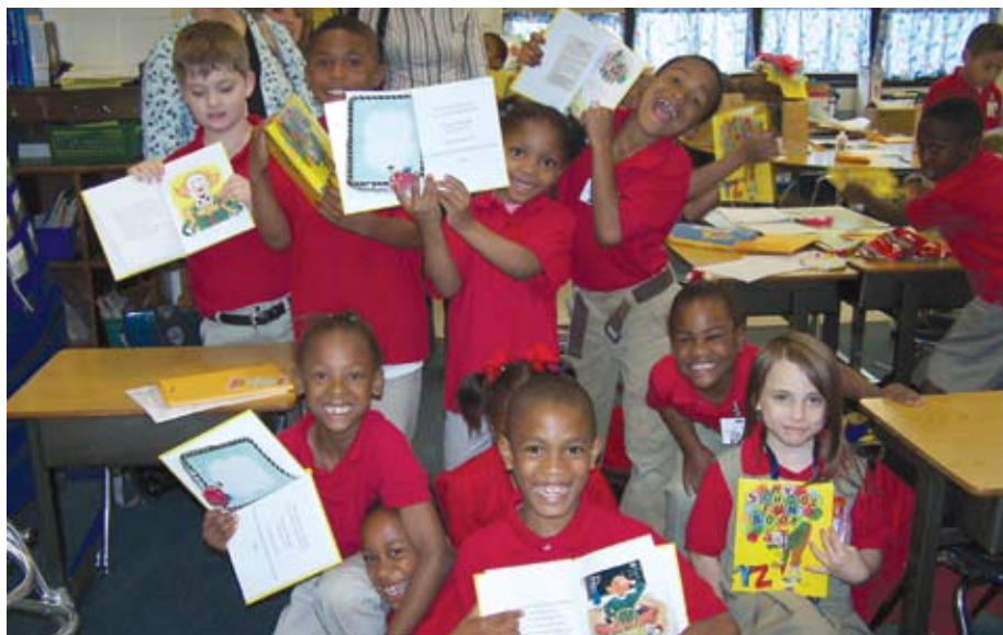
CHARACTER BOOKS... Kindergarten and first grade students love receiving their Character Books because the books include the students' names. The books are designed to promote reading and are given annually by East Iberville-INC.