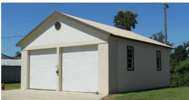
The old firehouse, built in the late 1950s, has been repaired and will soon become a museum housing fire memorabilia and village archives.