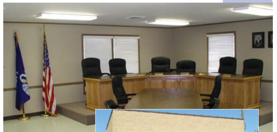
The Village of Rosedale's Council Chamber was recently updated with a fresh coat of paint and a new dais where councilmen can conduct their business.