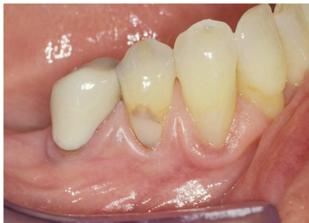
Figure 5. Discolored area at the occlusal aspect of the Class V restoration in the mandibular first premolar. This defect and the slight gingival defect were diagnosed as recurrent carious lesions.

reasons for restoration replacement show that glass ionomer restorative materials most often are replaced under the diagnosis of recurrent caries. 17,18 This finding by itself, coupled with the relatively short life span of glass ionomer cement restorations, indicates that the caries-preventive properties of restorative materials will not affect the restoration replacement rate, except in extreme situations such as when the patient has xerostomia. 60 Again the clinical diagnosis must be questioned. In vitro studies have shown that glass ionomer cements reduce the incidence and severity of recurrent caries, 61 but this finding has not been verified clinically and care should be exercised when applying the results of in vitro studies to the clinical situation. 62