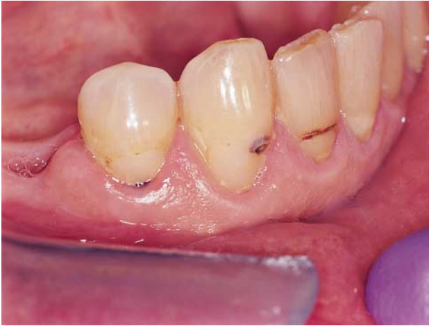
Figure 7. The Class V restorations in the lateral incisor, the canine and the premolar had stained discrepancies on the gingival aspect, and the lateral incisor also had stained discrepancies on the incisal aspect of the restoration. All of the restorations were diagnosed as having recurrent carious lesions.

did not extend deep into the tooth-restoration interface, the cavities were considered suitable for repair using a conventional restorative technique. The student then repaired the defects (Figure 9). The student treated ditched margins on amalgam restorations similarly by opening up the ditch from the amalgam side and then restoring the exploratory preparation whenever it was confirmed that the lesion was limited and localized. 63