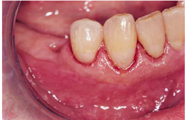
Figure 9. The localized defects at the cavosurface margins of the three Class V restorations immediately after the defects had been repaired and the gingival cord has been removed.

bond strengths, because of the difficulties in adequately filling the undercuts. My clinical experience with repair of amalgam restorations confirms the results of Smales and Hawthorne. 71 Resin-based composite restorations also may be repaired and refurbished successfully, and longevity studies of such restorations are in progress.