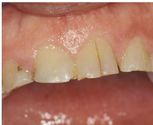
Figure 1. Vertical crack in the enamel of the right maxillary central incisor of an adult. The crack is stained but not carious.

of any restoration is more difficult for patients to keep plaque-free than any other part, especially if it is located interproximally. Finally, the gingival margins of Class II through Class IV restorations are difficult to examine clinically because it is not possible to view them directly and the explorer tends to stick regardless of whether the cavosurface margin is carious. Thus, a number of factors predispose a patient to the diagnosis of recurrent caries at the gingival margin of restorations.