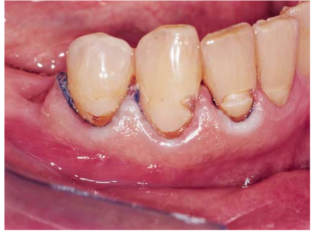
Figure 8. The three Class V restorations with localized defects shown in Figure 7 were prepared for repair by removing a small part of the composite material adjacent to the stained margins.

Reviews of literature and additional in vitro studies on the bonding between old and new materials used for repair of resin-based composite restorations 69 and amalgam restorations 70 indicate that the bond strength between new and old materials is less than that of intact specimens, but it generally is considered clinically acceptable. Diligent use of clinical techniques is required. Preparation of undercuts in the old material does not necessarily improve the repair