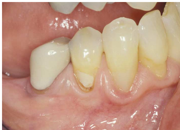
Figure 6. A brief grinding of the stained part of the restoration shown in Figure 5 with a fine finishing bur removed the stain under the resin flash. The small, discolored gingival defect was hard and was left untreated for monitoring of future progression.

Practitioners should consider repairing and refurbishing any localized defects at restoration