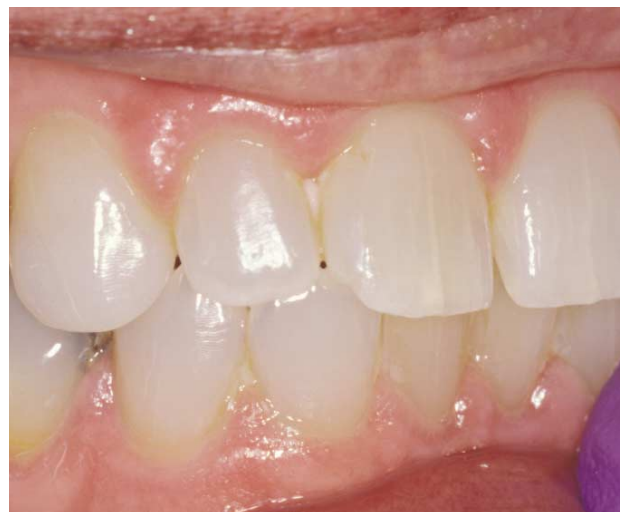
Figure 2. Vertical cracks in the left maxillary central incisor of a 22-year-old person. The cracks are unstained and not carious.

The amount of plaque and its cariogenicity at restoration margins depends on the restorative material. 34-38 These findings indicate that resin-based materials accumulate more plaque, and this plaque is more cariogenic than that seen on amalgam, silicate cement and glass ionomer materials. Practice-based studies have shown that there is no difference in the relative frequency of replacement of such restorations owing to a diagnosis of recurrent caries with the exception of silicate cement restorations, which were known to prevent recurrent caries but dissolved in situ . 17,18 These findings raise legitimate questions regarding the diagnosis. Is it really caries that is diagnosed?