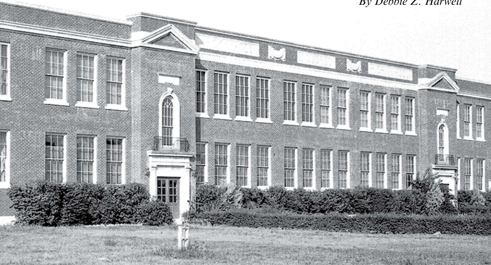
Yates High School, shown circa 1930s, was opened as the city's second black high school in 1926.