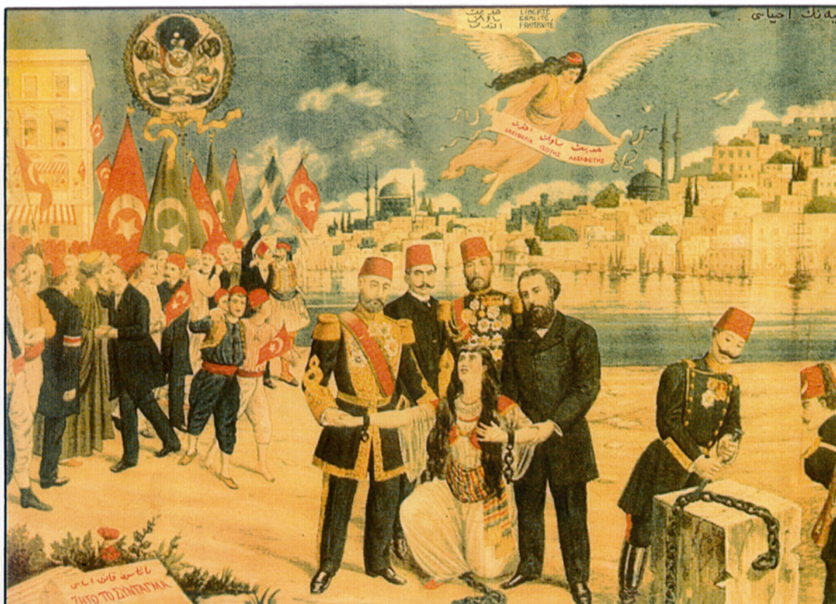
Didar-i Hürriyet kurtarılıyor (la Liberté sauvée) : carte postale de 1895, saluant la constitution ottomane du 23 novembre 1876, figurant le sultan Abdul-Hamid, les différents millets de l'empire (Turcs avec les drapeaux rouges, Arabes avec les drapeaux verts, Arméniens, Grecs) et la Turquie (non voilée) se relevant de ses chaînes. L'ange symbolisant l'émancipation porte une écharpe avec les mentions : « Liberté, Égalité, Fraternité » en turc et grec.

Using the following postcard that celebrates the 1908 Young Turks Revolution, analyze how the Young Turks presented themselves.