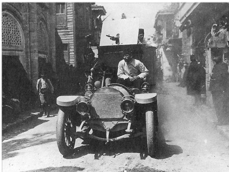
Young Turk revolutionaries in Istanbul in 1909.

Despite the liberal and inclusive rhetoric and the restoration of the Ottoman Constitution of 1876, the revolution of the Young Turks was more of a military coup intended to restrict the influence of the Sultan and promote a more Turkish and less Islamic vision of the Empire. In the first year after the revolution, the CUP's leadership seemed to honor the rhetoric of the revolution as it oversaw the restoration of the Ottoman parliament and relatively open elections. But due to a number of internal and external challenges beginning in 1909, the CUP gradually implemented a form of one party authoritarian rule. Instead of having disposed of Abdülhamid's autocratic and centralized