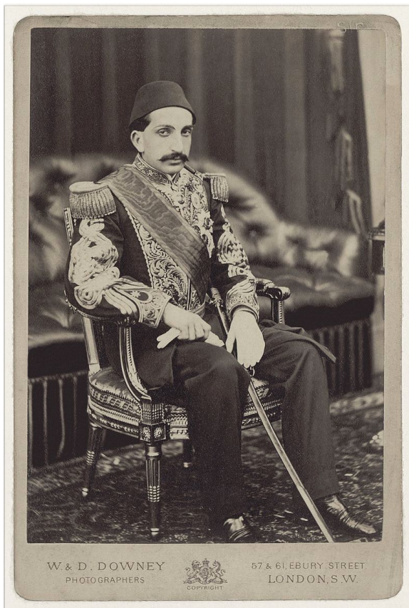
A photograph of a young Abdülhamid II taken in London in 1867.

numerous individuals across the Ottoman Empire debated, and sometimes enacted, their visions of how to save it. Some officials attempted to implement the Tanzimat to reform the aging state, while others offered visions of a secular, multi-ethnic empire or struggled for ways to reconcile Islamic legacies with Western science and philosophy. These competing visions of modernization culminated in the implementation of the first Ottoman constitution in 1876, which was primarily written by the Ottoman statesman Midhat Pasha. He introduced a parliamentary system and elections. He also personally interviewed the new Sultan, Abdülhamid II (r.1876 - 1909), to ensure his willingness to cooperate with the new constitution.