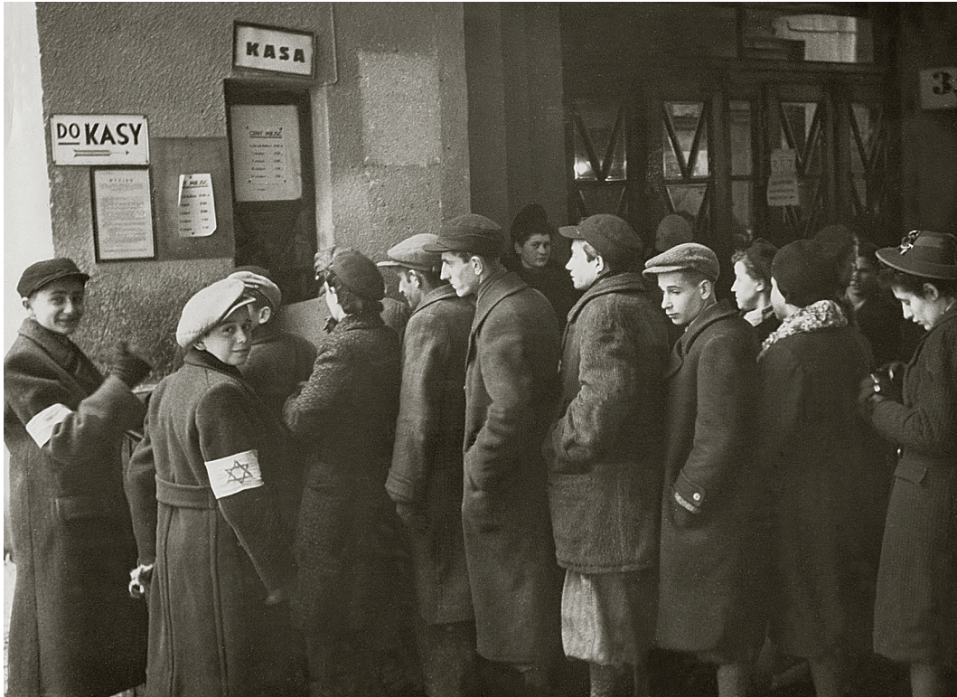
Jews in Krakau, Poland, 1940

haustible economic reserves and the Lebensraum the German people needed. A war against Bolsheviks and Jews could therefore be very little else than a war of annihilation. They were the sworn enemies of National Socialism.