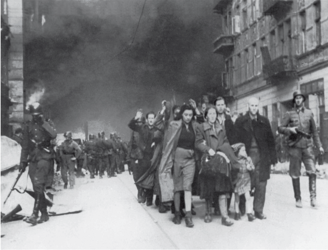
Cleaning out the Warsaw Ghetto, 1943