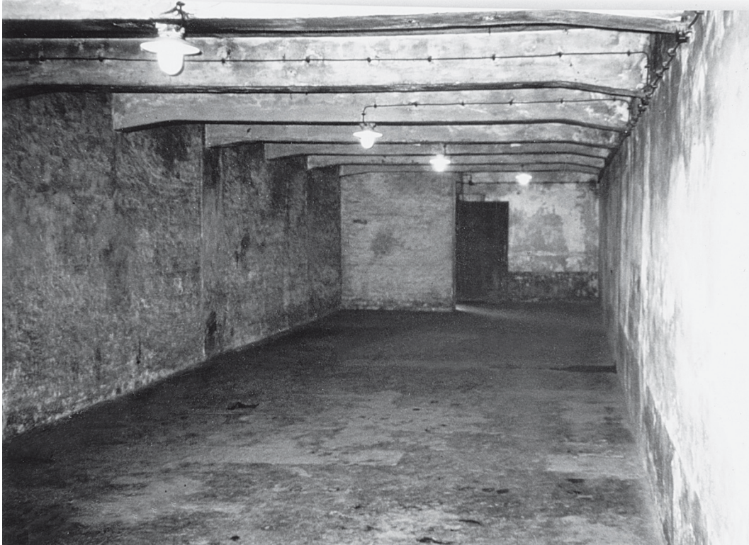
Gas chamber in Auschwitz

mans began to persecute the Jewish population here too, the resistance succeeded in evacuating 7,000 (of 8,000 in total) Jews safely to Sweden. Other Danish Jews were deported to the Theresienstadt camp, just one of the stop-off points en route to the extermination camps.