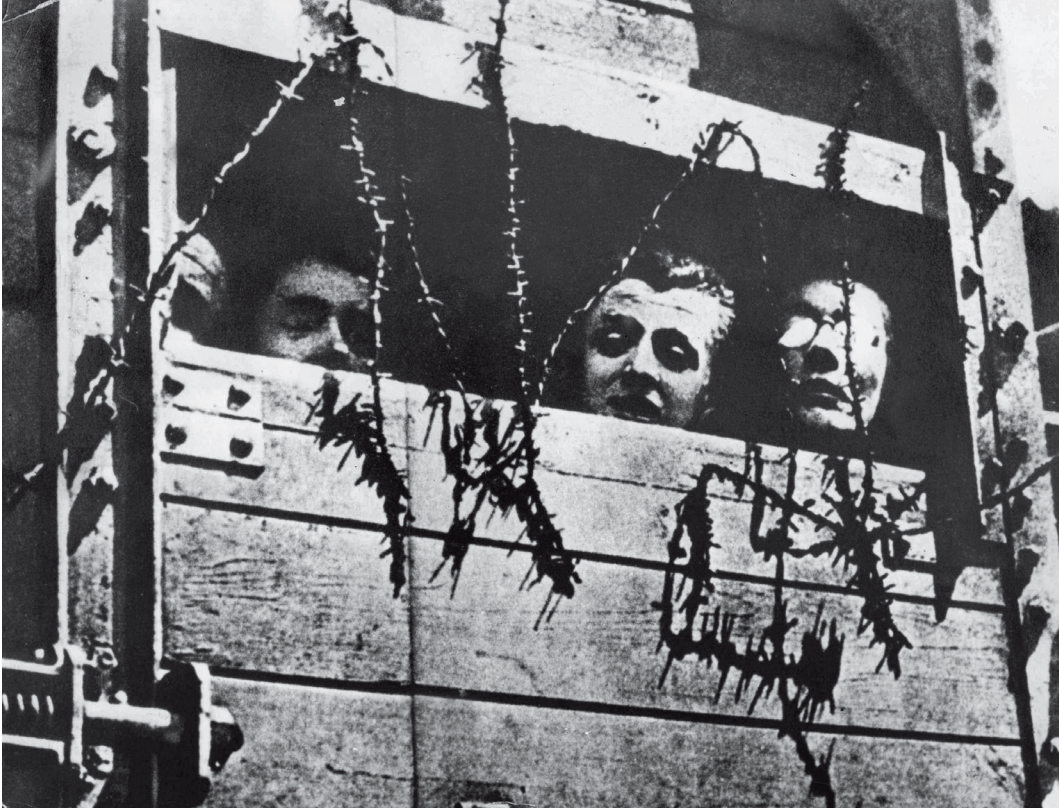
Deportationstrain France