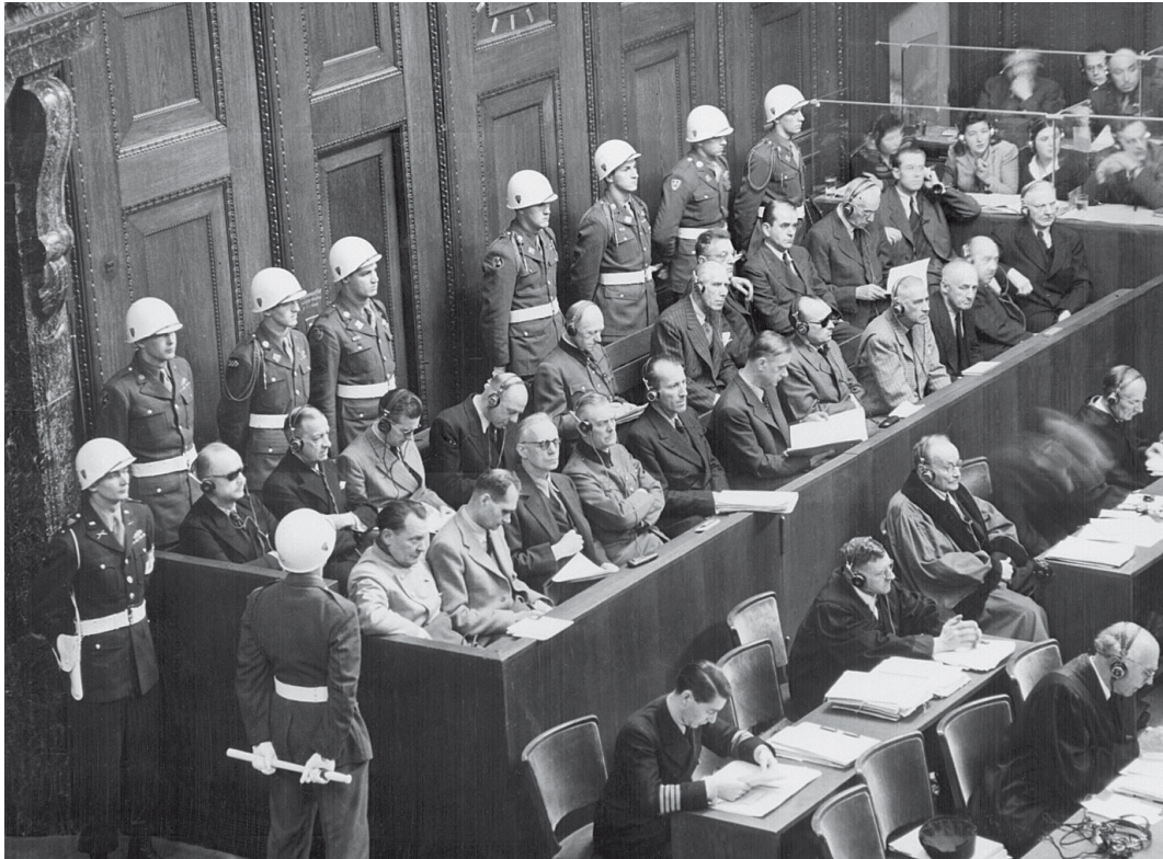
Nuremberg trials. Front row: Goering, Hess, Von Ribbentrop, Keitel, Rosenberg, Frank, Frick, Streicher, Funk, Schacht. Back row: Donitz, Raeder, Von Schirach, Sauckel, Jodl, Von Papen, Seyss-Inquart, Speer, Von Neurath and Fritzsche.