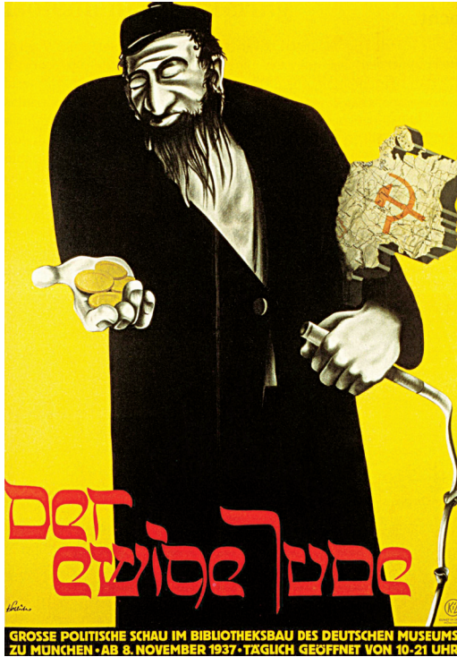
'Der Ewige Jude'