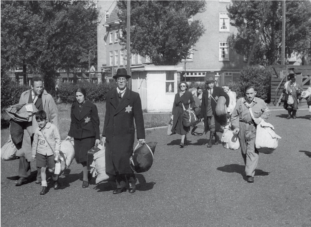
Deportation from Amsterdam, the Netherlands, 20 June 1943

signs of disobedience were met with gunfire. Sometimes there was a selection process after which Jews who were capable of working for the Germans could remain with their families: they had no choice but to stand by and watch as others were taken away. In Eastern Poland, they were mainly shot dead outside the towns and cities. In the west, the Jews were assembled in stations and deported in miserable conditions, without facilities, in overfull freight trains to the extermination camps. In the camp, they were removed from the trains by Trawniki workers, who often originated from Ukraine. Some of them former prisoners of war, they had been trained in camp Trawniki. Everything was then removed from the victims: possessions, jewellery, money and clothing. Their hair was shaved off. Often the Jews were told that they were going to shower, to disinfect them. Then they were led into the gas chambers. Some Jews were selected to work in Sonderkommandos in the gas chambers. They were forced to remove the bodies from the gas chambers, take any gold and silver from the teeth and carry away the corpses. Initially, they were thrown into mass graves, but when these were full, the bodies were incinerated in crematoria. Here too, the hard work was left to the Jewish Sonderkommandos .