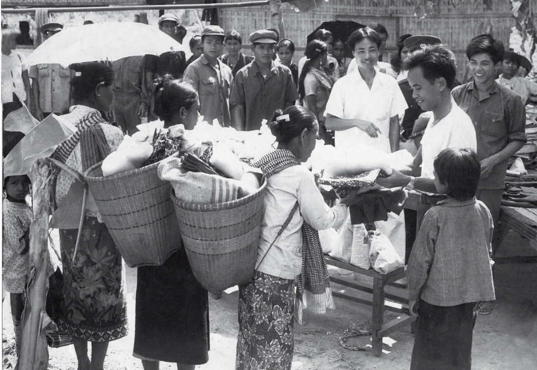
Ethnic people at the market, selling fabrics

tirely eradicated. About half of the 450,000-strong community had been expelled by the United States-backed Lon Nol regime in 1970 (with several thousands killed in massacres). Over 100,000 more were driven out by the Pol Pot regime in the first year after its victory in 1975. The ones who remained in Cambodia were simply murdered.