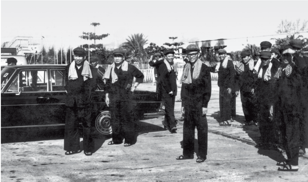
Democratic Kampuchea leaders and members of the Standing Committee of the Central Committee of the CPK

Mok, was CPK secretary of the key Southwest Zone and later Chief of the General Staff of the Khmer Rouge armed forces; and Ke Pauk, Party Secretary of the Central Zone of DK, later became Under Secretary-General of the Khmer Rouge armed forces.