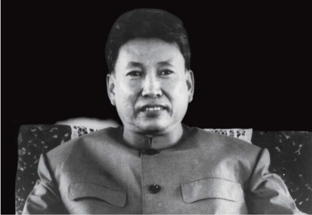
Pol Pot, 1978