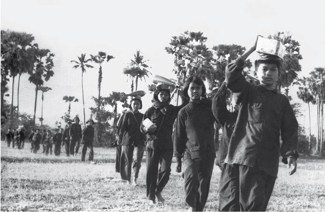
Children at work during Democratic Kampuchea

'Then, from January 1977, all children over about eight years of age, including people of my age [20 years], were separated from their parents, whom we were no longer allowed to see although we remained in the village. We were divided into groups consisting of young men, young women, and young children, each group nominally 300-strong. The food, mostly rice and salt, was pooled and served communally. [...] Also in early 1977, collective marriages, involving hundreds of mostly unwilling couples, took place for the first time. All personal property was confiscated. A new round of executions began, more wide-ranging than that of 1975 and involving anyone who could not or would not carry out work directions. Food rations were cut significantly, leading to many more deaths from starvation, as were clothing allowances. Three sets of clothes per year was now the rule. Groups of more than two people were forbidden to assemble.'