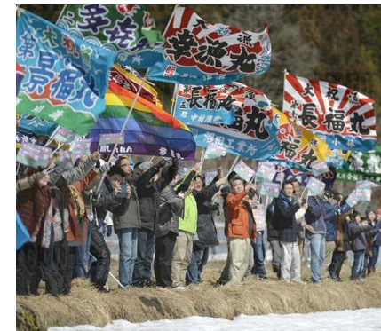
People celebrating the opening of the Hokkaido Shinkansen with big fishing flags, 2016