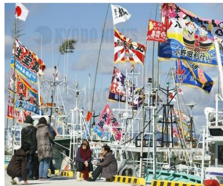
The return to Sabato port (2017) of fishing boats that had evacuated due to the Great East Japan Earthquake