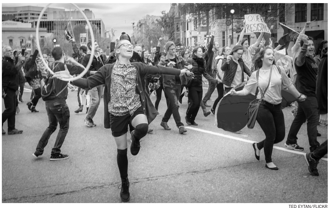
Impromptu celebrations, like this LGBTQ dance party in Amsterdam, broke out all around the world after news spread that Donald Trump had fled the White House and abandoned the presidency.