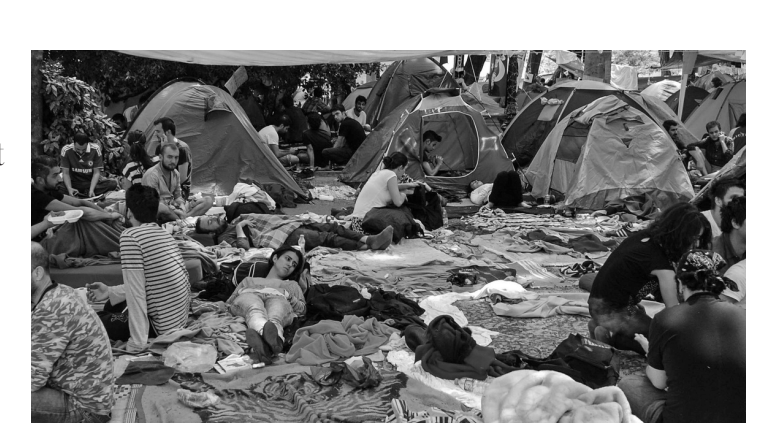
A tactic reborn for a populist moment, Occupy Wall Street has become Occupy the Picket Line

tivists convinced former [white nationalist Le Pen voters to support a left populist, Mélenchon. In the same way, the hard work of activists has begun to swing many Trump supporters who wanted change at all costs. Presented with an alternative, Americans prefer it to Trumpian fear and hatred."