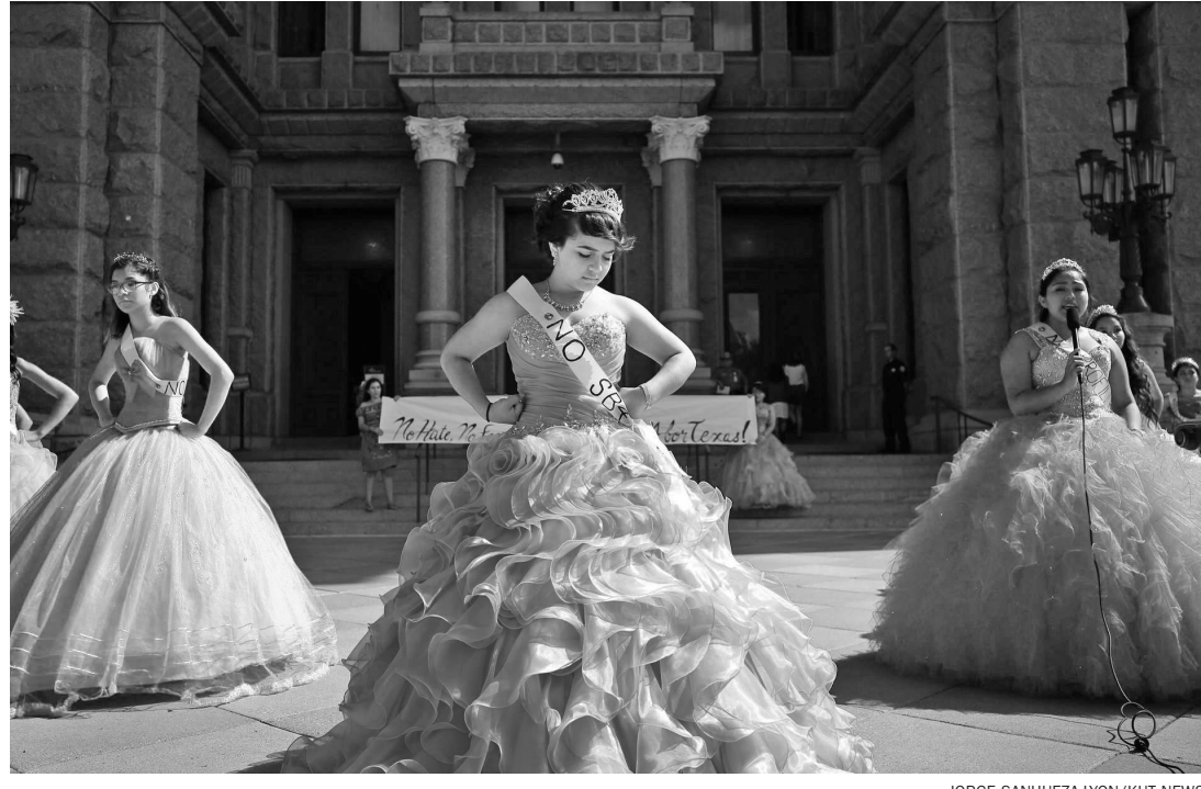
Protesters dressed in brightly colored quinceañera dresses get in formation, preparing to blockade a government building with a "wall of floof."

Organizers said they took inspiration from two action guides published after the midterm elections. "Indivisible on Offense," released on November 18, 2018 by the nationwide network that played a key role in spurring grassroots Congressional advocacy during Trump's time in office, provided strat-