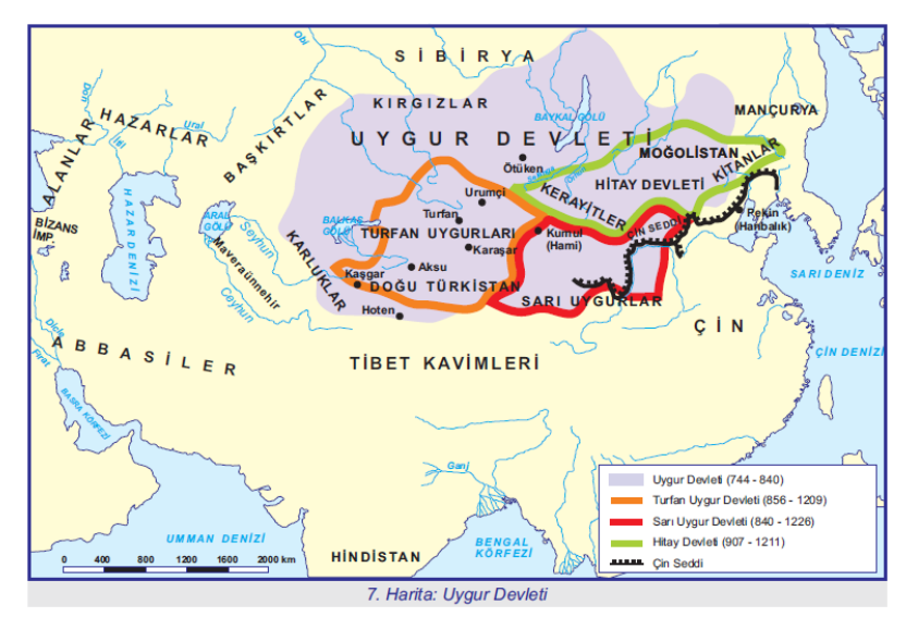
7. Map: The Uyghur State

The assumed tension between Turkey and China goes back millennia in history. In this historical view—which does not relate only to the past but also to the present—Turkey and China are neighbors and rivals. Past geopolitical conditions are kept alive in students' imaginations through the presentation of maps, historical texts, cultural history and vivid images. As an example, the following map describes the historical Turkish Uyghur Empire which covers parts of China as well. <sup>17</sup>