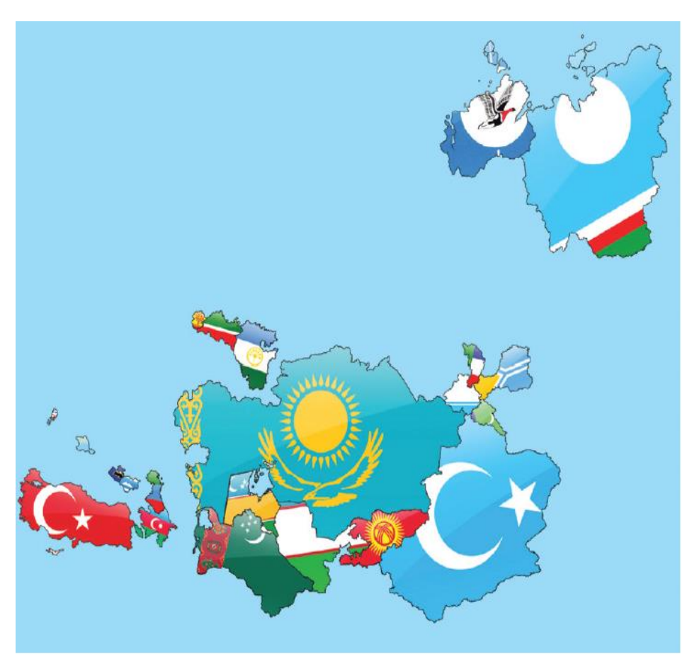
Türk dünyası The Turkish World

The accompanying map of the "Turkish World" is made out of contemporary flags of the various countries and territories of which it is comprised. Note the "East Turkestan" flags covering vast swaths of Chinese territory. <sup>25</sup>