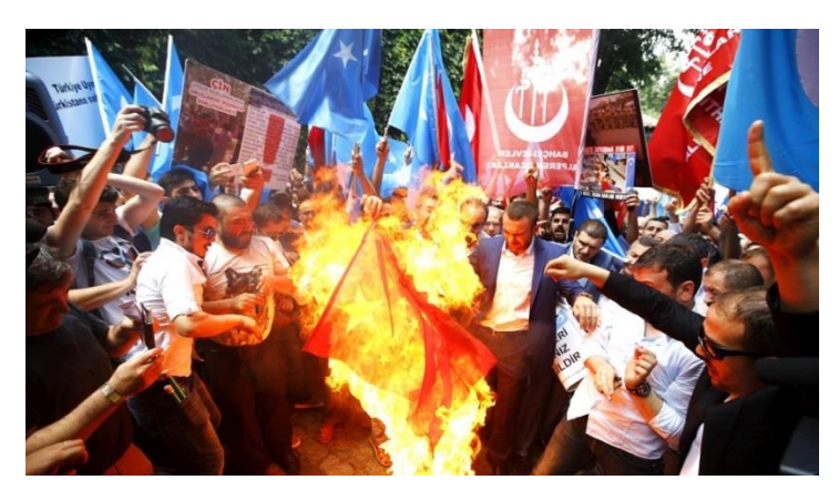
Protestors burned Chinese flag during a protest near the Chinese Consulate in Istanbul, Turkey on July 5, 2015. 11

Several days later, on July 9, the Thai embassy in Istanbul was attacked by a group of about two hundred men affiliated with the East Turkestan Solidarity Group, following Thailand's decision to deport approximately one hundred Uyghurs back to China. Protesters, with rocks and thick wooden planks, broke windows and pounded on doors while shouting " Allahu Akbar " [Allah is the greatest] while waving "East Turkestan" flags. <sup>10</sup> East Turkestan or "Uyghurstan" is the name used by Uyghur separatists and supporters in place of Xinjiang.