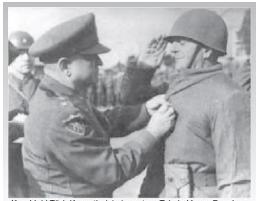
Kore'deki Türk Kuvvetlerinin komutanı Tahsin Yazıcı Paşa'mız, BM Ordu Komutanı Walton Walker'dan madalyasını alırken