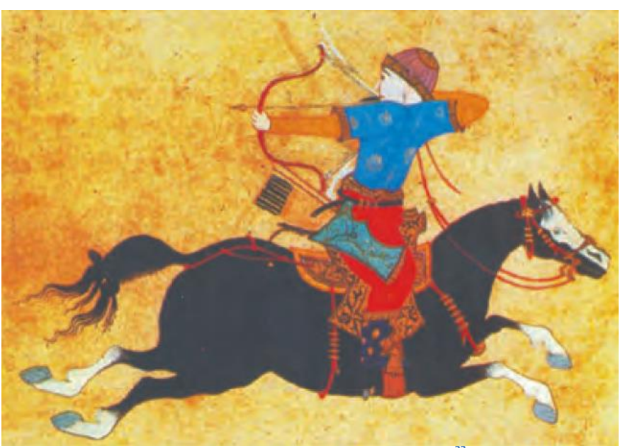
Illustration for Discussion on "The Strategy of the Turkish Army" 23

The conflicts between China and the various Turkish empires of days past seem to really matter to the authors of the curriculum, along with the idea that the world should consider Turkey in a leadership role. These include Turkish (in English often called Turkic) peoples and states; the dwellers of former Turkish-led Muslim empires (particularly the Ottoman but also the Seljuk); the Sunni world; and the Muslim world in general. Turkey also considers itself to be part of other blocks, such as Europe, NATO, the Third World and the Mediterranean Basin.